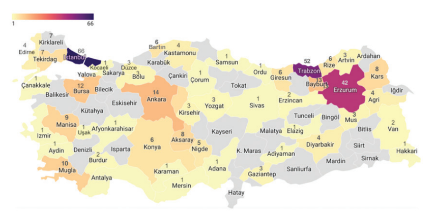
Figure 1 Distribution of the number of FMs according to the cities in which their affiliated HEIs are located