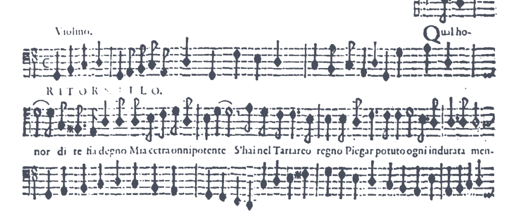
Example 6: L'Orfeo, Act IV, Qual onor di te fia degno.

The second half of Act II is pervaded with shock from the death of the beloved Eurydice and crying over the loss. The opening of Act IV is still marked by grief, but also by hope: Proserpine is trying to mollify her husband, the ruler of the underworld. This system of reverse images is 'distorted' ('curved') by the end of the fourth act, when Orpheus does not observe the terms and loses his beloved again, this time, most probably, forever.