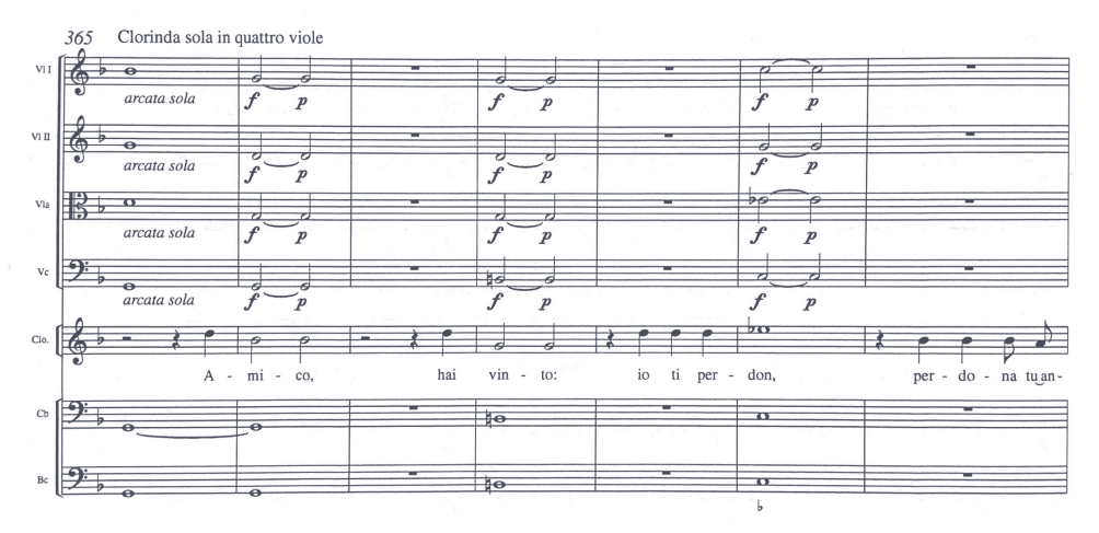
Example 1: Il Combattimento di Tancredi et Clorinda, bars 365-371.

numerous asymmetries, but, on the other, is at least framed in regular octaves. A breakdown of verse into isolated statements takes place in the dying girl singing as well. The deadly wounded warrior cannot talk – the composer interrupts her text with pauses.<sup>11</sup>