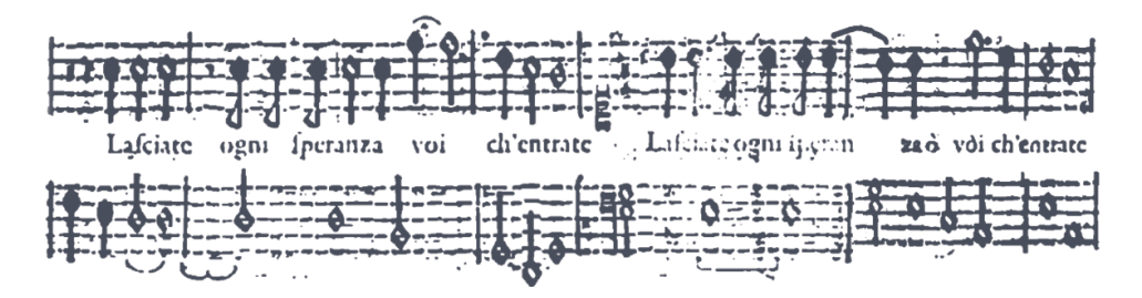
Example 2: L'Orfeo, Act III, Speranza.

A character in which can be observed the Shakespearian changing of emotions – of happiness, sadness, uncertainty, and even despair – is the eponymous hero of Monteverdi's first opus in genere rappresentativo (1607). This manifests itself both in the macrostructure of the work and the central aria, in which Orpheus tries to overpower Charon by means of his singing ('Possente spirto e formidabil nume', Act III). For Orpheus's key moment in the underworld, Striggio (who, in his libretto, oscilates between various poetic forms)<sup>14</sup> opts for a terzina, a strophe from Dante's The Divine Comedy . Dante's poem is referred to even earlier in the work, in the singing part of Hope (Speranza) by means of a verbatim quotation from the epic: 'Lasciate ogni speranza, voi ch' entrate'.<sup>15</sup> The composer emphasises the inscription over the gate to Hell by figure of a hyperbaton – he repeats the line a second higher, thus enriching the structure of the text.