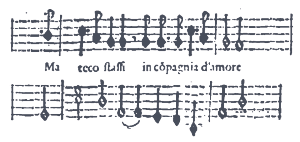
Example 7: L'Orfeo, Act I, Euridice, Ma teco stassi in compagnia d'Amore.

Partial parallels can also be found in the work's microstructure, that is, the individual scenes or music and poetic forms. Let us mention Orpheus's declaration of love, 'Rosa del ciel, vita del mondo', which, in the context of a buoyant celebration, strikes the audience with its sincere simplicity and decorum. Eurydice is moved by Orpheus's singing and promises to stay with her husband in a union filled with love: 'ma teco stassi in compagnia d'Amore'.