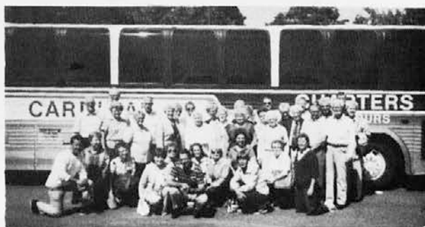
Bus trips have been enjoyable for members. They've visited National Slovenian Heritage Day in Hibbing, Nashville, Ironworld, USA and Baraga Days. The branch has participated generously in fund drives for the Slovenian Miners and Laborer's Memorial in Minnesota, Hands Across America and the Statue of Liberty Restoration.

Convention Hostess Branch 20 is comprised of various nationalities, members of all ages and interests, all working together with a common goal.