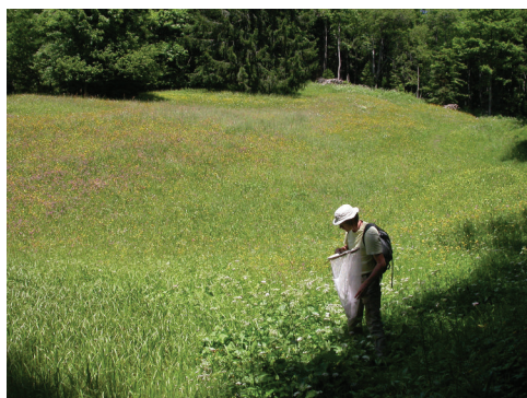
Fig. 2: Planina pod Golico 2. Flower rich meadow.