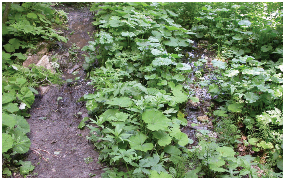
Fig. 7: Planina pod Golico 2. Larval habitat of Arctophila bombiforme.

Biology. Egg laying was observed in a small rivulet in shaded forest (figure 7). The female was flying low over the water and settling on the rocks and moss cushions several times before landing on a moss overgrown rock where it moved slowly backwards to the water to oviposit one visible egg on the moss just above the water level.