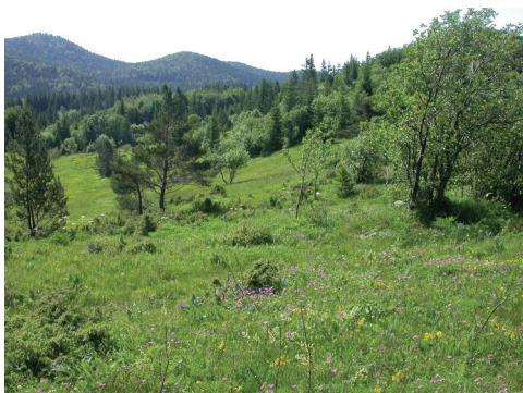
Fig. 4: Volovja Reber.