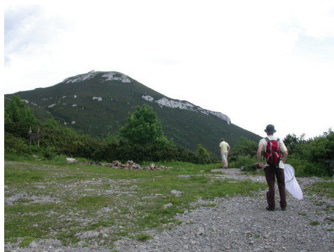
Fig. 5: Snežnik.

reedbeds and with forest edges with lots of flowering Aegopodium podagraria in and along Beech ( F. sylvaticus ) and Fir ( A. alba ) forest. Along a brook also willows ( Salix species) and maple ( Acer species) (figure 3).