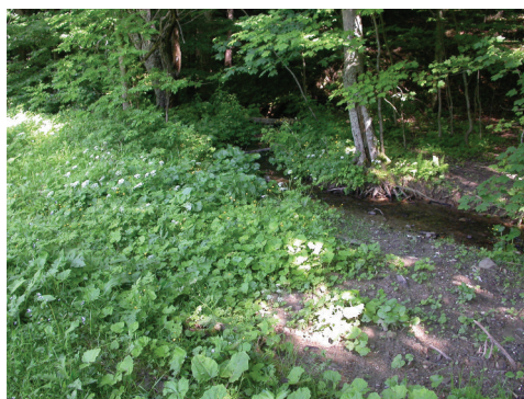
Fig. 3: Javorniški Rovt (photo: J. van Steenis).

Planina pod Golico 2 (site 2 in figure 1). Slovenia, Gorenjska, Jesenice, Planina pod Golico, meadow, 19 June 2008, alt 1100m, N 46°28'29", E 14°03'35", W. van Steenis, J. van Steenis. Habitat: Flower rich meadow close to Beech ( F. sylvaticus ) and Fir ( A. alba ) forest (figure 2).