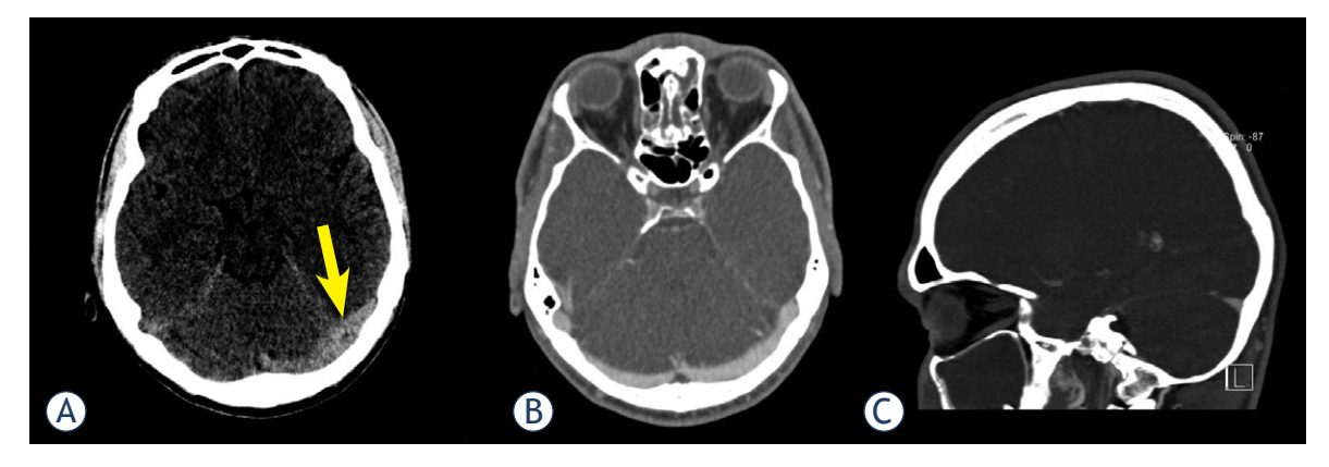
FIGURE 2. Left transverse sinus (LTS) of a 26-year-old male appeared hyperattenuated on non-contrast computed tomography (arrow) (A) and was interpreted as thrombosed by both readers. However, CT venography in axial (B) and sagittal (C) reconstruction showed patency of the LTS. Average attenuation inside the LTS was 60 HU.

Normal D-dimer levels have previously been considered to have a high negative predictive value in patients with suspected CVST.<sup>7</sup> Recently, normal D-dimer levels were reported in patients with isolated thrombosis of deep cerebral venous system and were explained by the relatively small thrombus volume.<sup>14</sup> However, we found normal D-dimer levels in 2 patients with CVST, suggesting that D-dimer is of limited value in excluding the diagnosis.