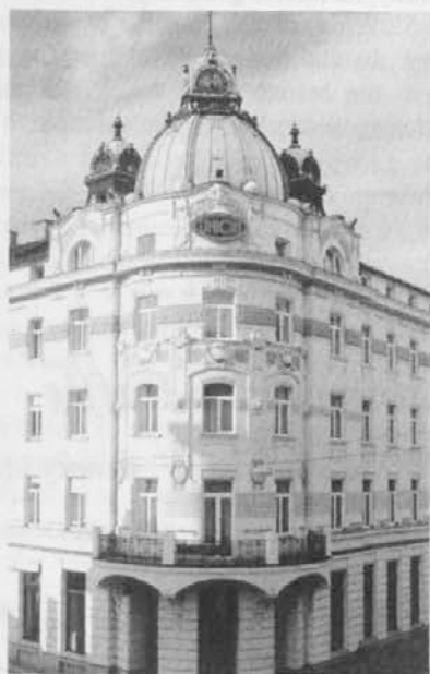
4 Star Grand Hotel Union