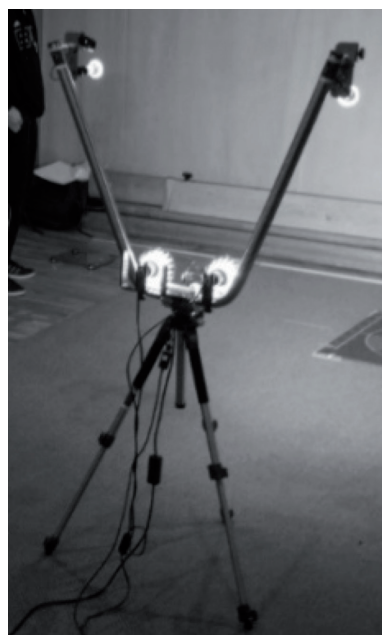
Figure 3. "V" camera frame.

18th second of positioning. The comfort criterion adopts assumptions in terms of pose equilibrium, while the shading criterion eliminates the ambiguities of postures considering the image illumination. One can emphasise that the removal of ambiguous 3D poses related to a single image is the focus of posture analyses (18). After the screening, the markers are removed from the subject and placed on the following subject to be tested. The process of assembly and testing instrument calibration is repeated every time the location is changed, specifically