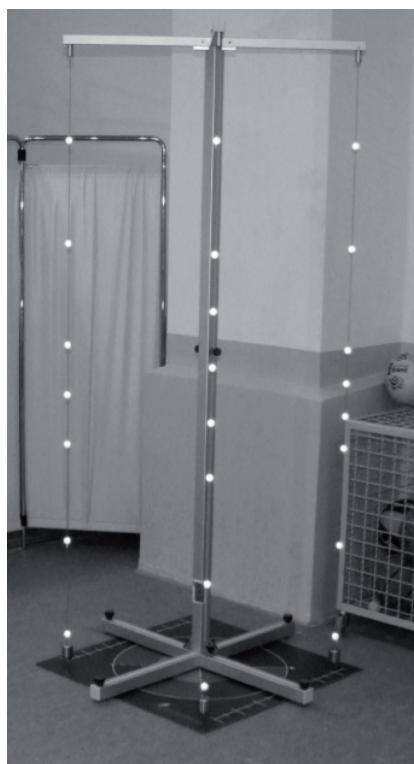
Figure 2. Calibration frame.

be at least 2 metres and 15 centimetres (Figure 3.). The images taken by the camera need to be sharpened in the software programming, in order to start the space calibration. After the calibration has been concluded, the 3D Calibrator is packed away, and the testing can be initiated.