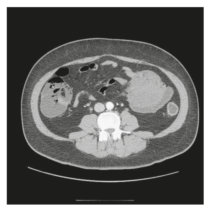
FIGURE 2. CT scan shows the desmoid tumour of the mesentery infiltrating the small bowel: a well-defined hypodense and homogenous mass diffusely attached to the bowel wall.

raphy (CT) revealed a 8.2 \times 7.2 \times 7.4 cm mass infiltrating the small bowel. The tumour attenuation was of 33 Hounsfield units and it enhanced poorly and homogenously with an intravenous contrast (Figure 2). The above preoperative imaging studies suggested a GIST involving the small bowel.