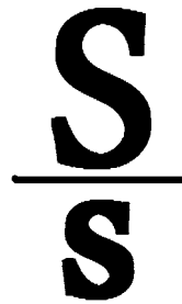
Figure 2: Lacan's Saussurean algorithm (Lacan 1966)

For Sapir, the actual behaviour of an individual is the actualisation of meaning intuitively derived from the cultural pattern. Meaning (what the colour black means in a particular society, for example) is not directly rooted in a concrete behaviour or cultural element; on the contrary, these by themselves tell us nothing about culture: ‘It is the culture of a group that gives the meanings to symbolisms without which the individual cannot function, either in relation to himself or to others’ (Sapir 1994: 244).