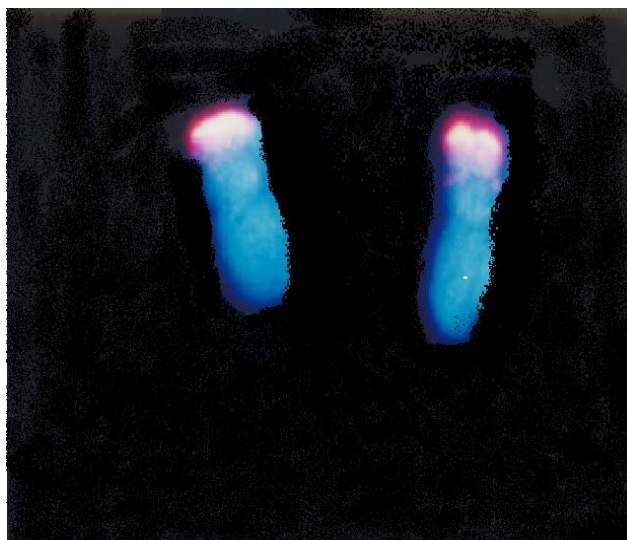
Figure 4. The 1B/1R translocations are restricted to the 1B chromosome SAT region. The two translocated chromosomes are from one metaphase cell of the bread wheat cultivar "Yugoslavia". Red dots represent biotin labelled rye signals (Avidin – Cy3, magnification ca. 3000x).

analyses of storage proteins (HMW and LMW glutenin subunits), using SDS PAGE electrophoresis would be reasonable for this wheat cultivar.