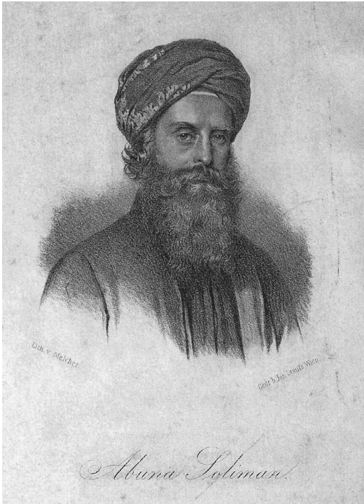
Portrait of Dr. Ignacij Knoblehar - Abuna Soliman (1819–1858)