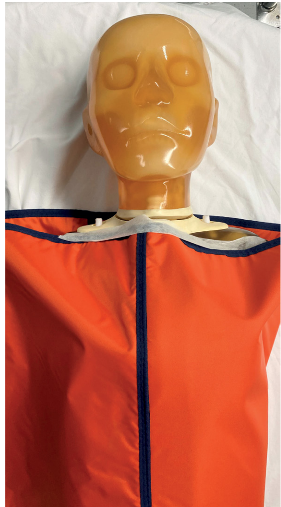
FIGURE 1. Presentation of the shielding position used in the study.

Radiosensitive structures that lie in the primary field cannot be easily protected, meanwhile the structures outside the CT scanning plane, such as the breasts during the head CT examination, can be easily protected against the scatter radiation. During the head CT examination the use of lead shielding can significantly reduce the exposure