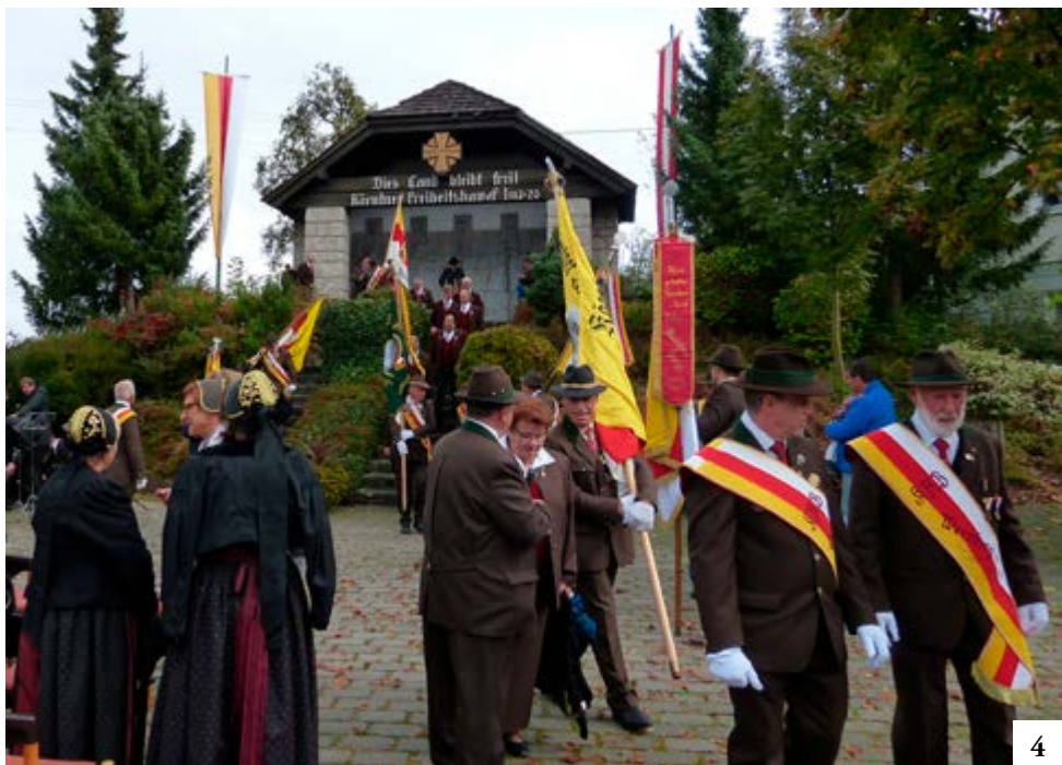
Figures: 1. Street name in Klagenfurt/Celovec; 2. First Lieutenant Ludwig Hugo Hulgerth; 3. Cover page of magazine Zur Zeit; 4. “Dies Land bleibt frei!” St. Jakob in Rosenthal.