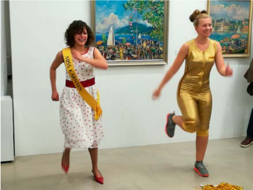
Figure 9. Das Andere Land - Performance.