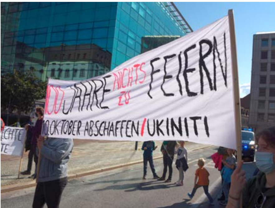
Figure 10. Hundred Years - Nothing to Celebrate! AntiFa demonstration, 10.10.2020.