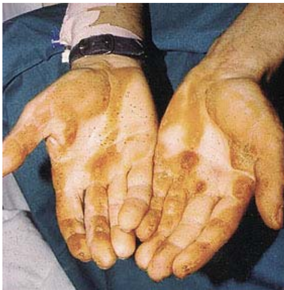
Figure 2. Linearly arranged lesions on hands.

tant keratotic changes. The lesions were painless but the patient complained of difficulties in extending fingers and wearing shoes. Hyperpigmented velvety papules coalescing into plaques could be seen in skin folds, including