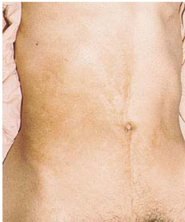
Figure 3. Streaks of hyperpigmented coalescing macules on the lateral trunk.

pects of his fingers and the lateral margins of his index fingers (Fig. 2). The fourth and fifth fingers of the left and the third finger of the right hand presented no hyperkeratotic lesions. There were no nail involvement or dis-