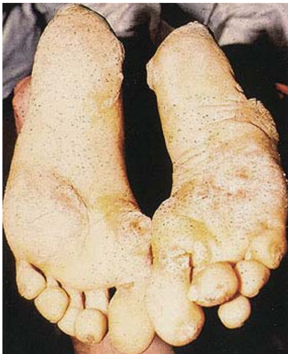
Figure 1. Nummular keratotic plaques on pressure points on soles.

pects of his fingers and the lateral margins of his index fingers (Fig. 2). The fourth and fifth fingers of the left and the third finger of the right hand presented no hyperkeratotic lesions. There were no nail involvement or dis-