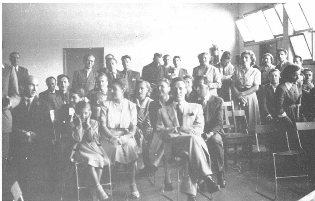
Prvi sestanek - First Meeting St. Albans 1954

45 L YEARS T Praznujemo 45. Letnico Slovenskega Društva Melbourne Inc. Celebrating the 45th Anniversary Slovenian Association Melbourne Inc.