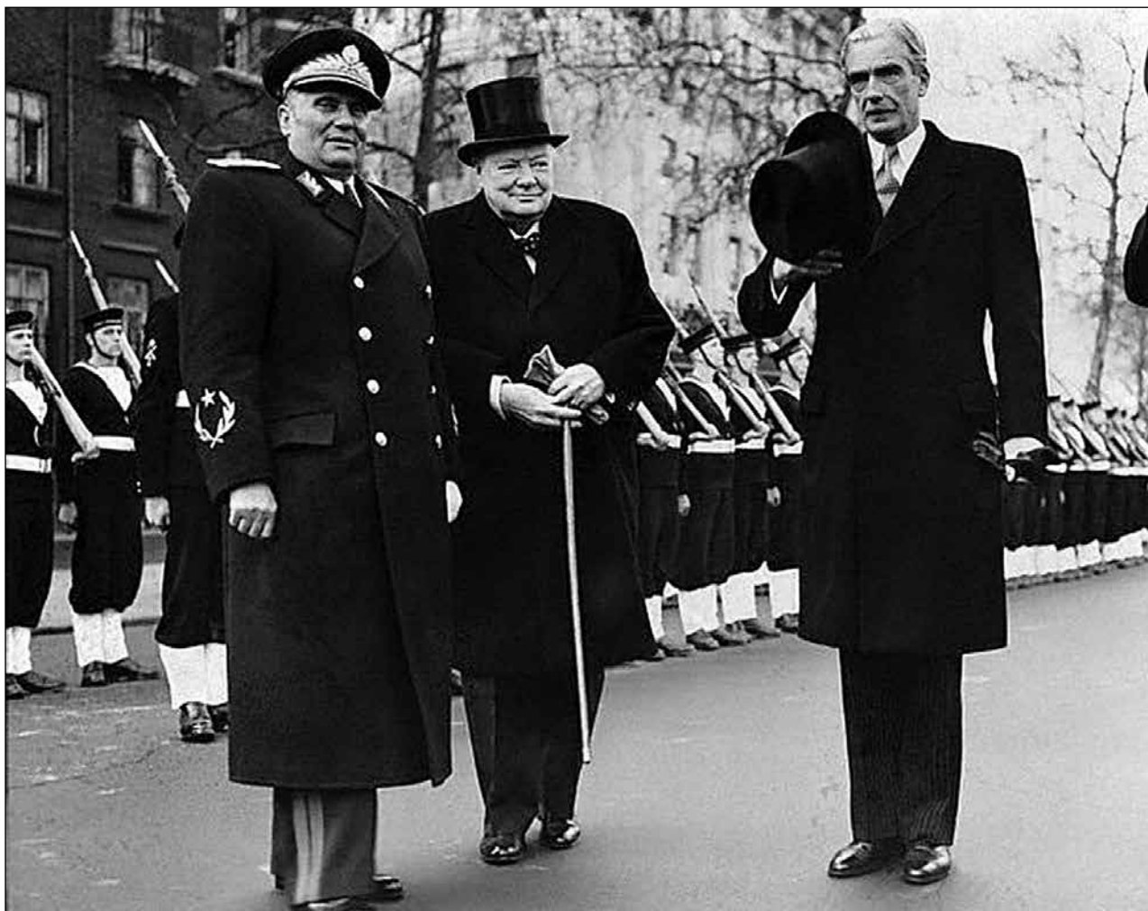
Fig. 3: Tito, Churchill and Eden in London, March 1953. Sl. 3: Tito, Churchill in Eden v Londonu, marec 1953.