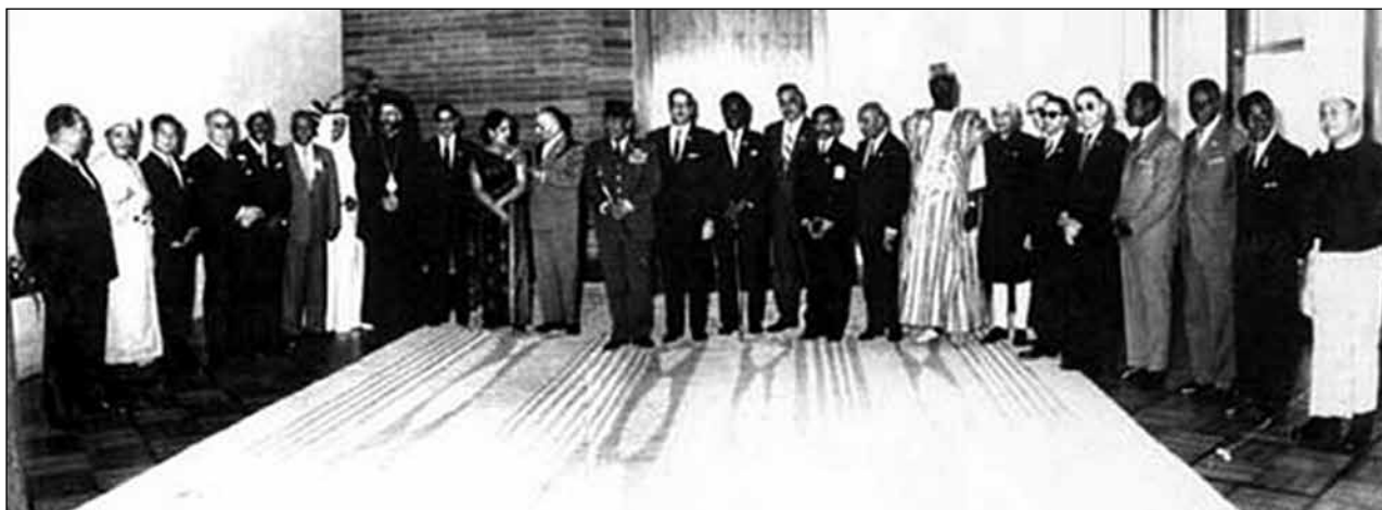
Fig. 8: Tito with the leaders of the Non-Aligned Movement in Belgrade, September 1961. Sl. 8: Tito z voditelji gibanja nevrščenih v Beogradu, september 1961.

Nasser got the impression from Tito that everything is set for a conference and that Indian leader Nehru would co-sign an invitation letter with the two of them. However, Nehru did not agree yet, as Mićunović discreetly reminded Tito. Therefore Tito had to convince Nasser that the two of them should coauthor an invitation, persuading Nehru to join in later. Although conceding, Tito did not forgive to Mićunović this intervention into his personal diplomacy, which ended with a heated quarrel between the two (Mićunović, 1984, 22).