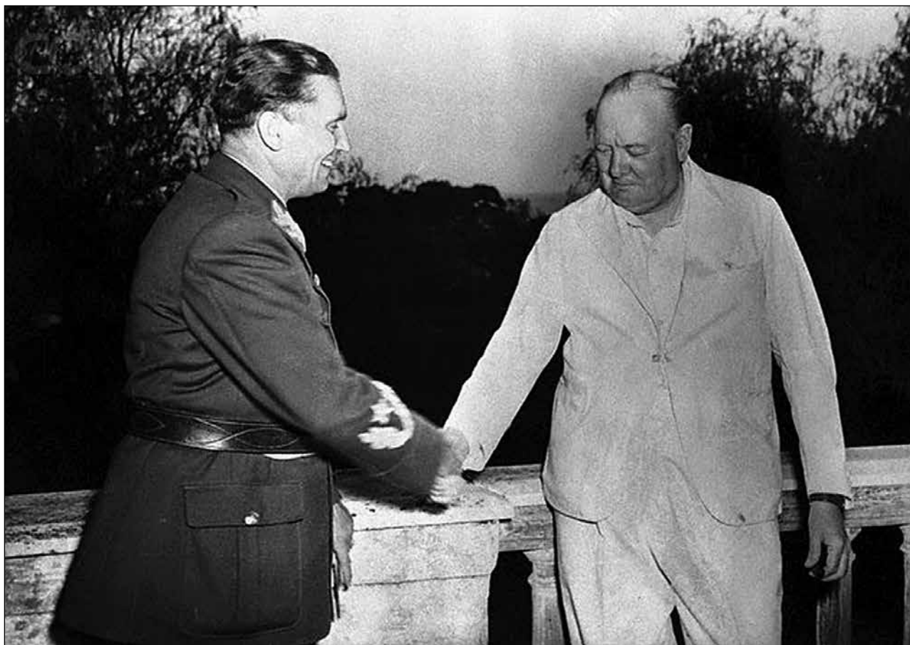
Fig. 1: Tito and Churchill in Naples, August 1944. Sl. 1: Tito in Churchill v Neaplju, avgust 1944.

of transition, foreign policy was technically conducted through the State Secretariat for Foreign Affairs (DSIP), headed by prewar diplomats Ivan Šubašić (1943–1945), Josip Smolaka (1945) and Stanoje Simić (1946–1948). However, the "old" diplomacy was out, and its representatives were not trusted (Petković, 1995, 18–37). The true conduct of international relations was determined in the Politburo of the Communist Party, and much of diplomatic exchange was conducted by Tito himself, through his official visits. His itinerary left no doubts about his ideological and geopolitical leanings: he avoided the West and cruised the East. In 1945, he visited the USSR, then Poland and Czechoslovakia (1946), the USSR again in 1946, then Bulgaria, Hungary and Romania the following year (Petranović, 1987, 5–29; Sovilj, 2007, 133–153). His chief press secretary recalls that "the visits were conducted according to the patterns of the times. Public speeches were mentioning the countries of people's democracies, which have 'a great friend in the USSR, invincible country of socialism'. They were completed with the signing of a treaty of friendship, mutual help and cooperation, according to the template of the same treaty signed before all oth-