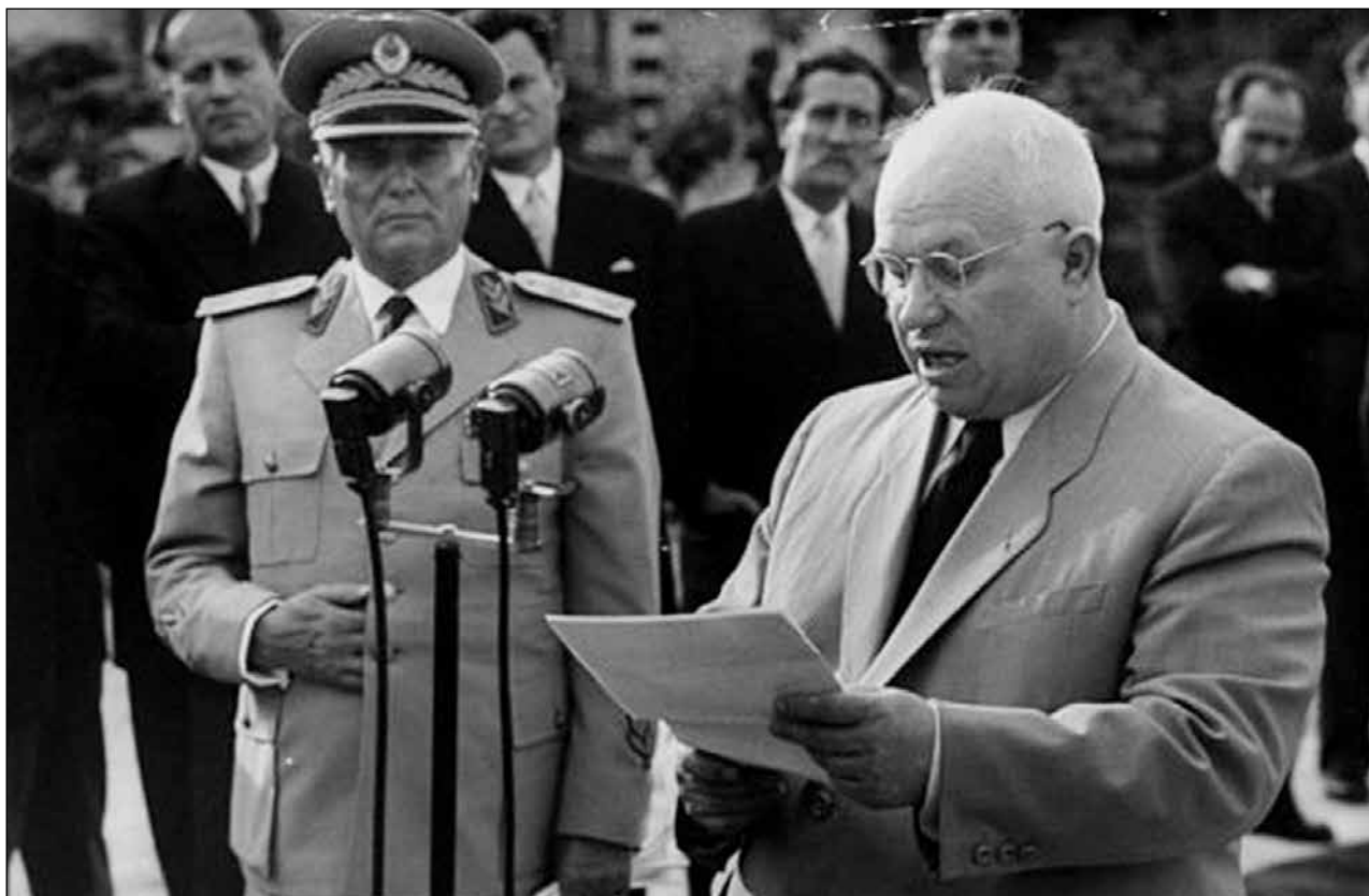
Fig. 4: Tito receives Soviet delegation in Belgrade, June 1955.

Sl. 4: Tito sprejema sovjetsko delegacijo v Beogradu, junij 1955.