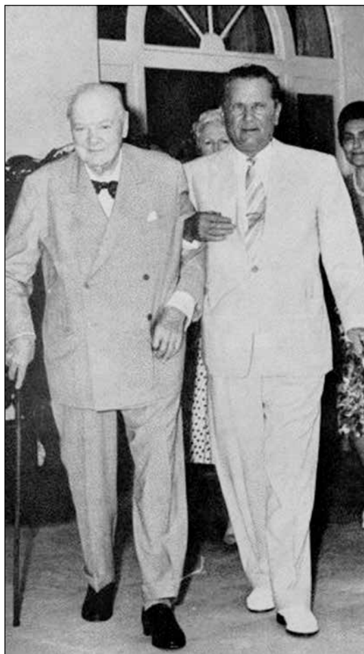
Fig. 9: Tito and Churchill in Split, July 1960.

Sl. 9: Tito in Churchill v Splitu, julij 1960.