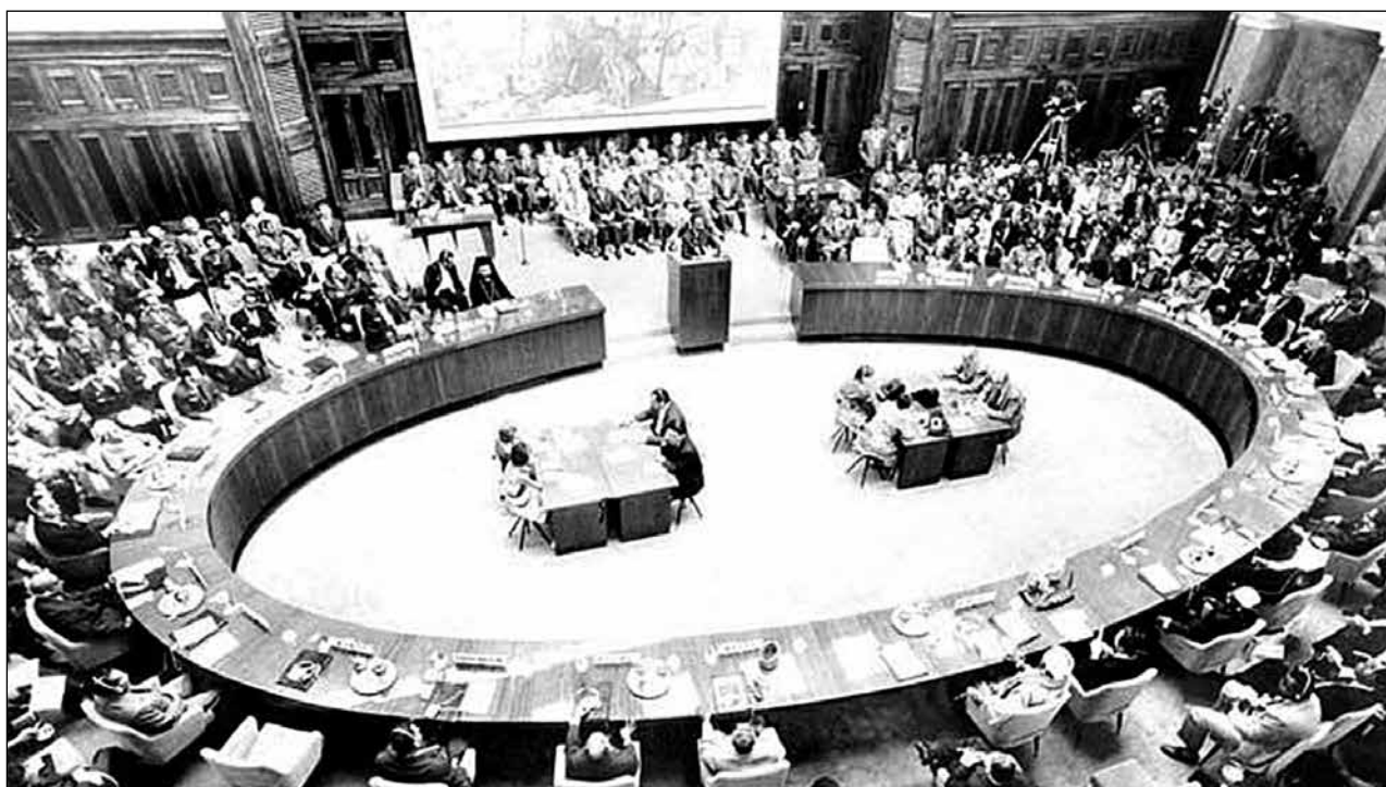
Fig. 7: Summit of Non-Aligned, Yugoslav Federal Assembly, September 1961. Sl. 7: Vrh neuvrščenih v jugoslovanski zvezni skupščini, september 1961.

a resolution urging the superpowers to resume peace negotiations. To that end, Yugoslav mission in New York hosted a meeting on September 29, between Nkrumah, Nehru, Sukarno, Nasser and Tito, who announced their joint resolution in the General Assembly. 6 The resolution did not pass, but it did gain visibility. The timing was right as the topic of this General Assembly session was admitting 16 African countries for membership, a trend which Yugoslavia supported wholeheartedly through the Declaration on the Granting of Independence to Colonial Countries and Peoples in December 1960.