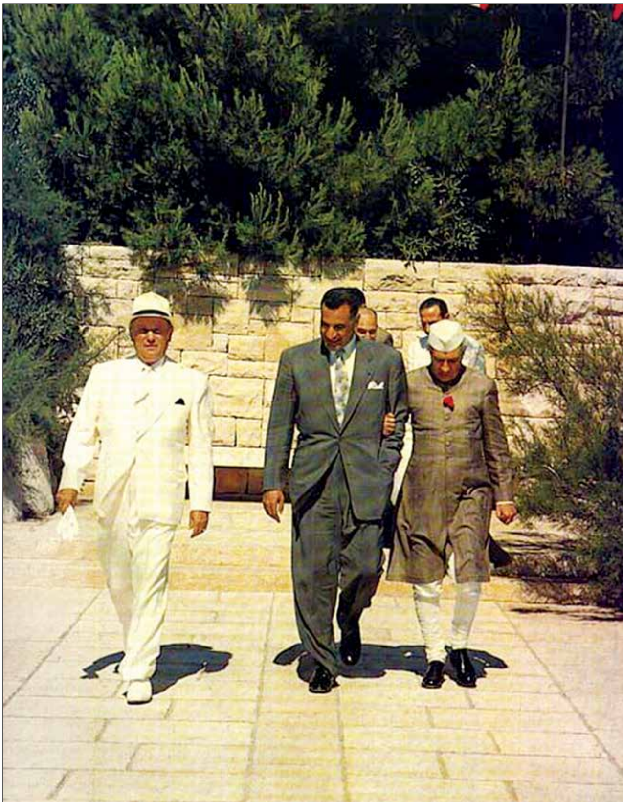
Fig. 5: Tito, Nasser and Nehru on the Brioni Islands, July 1956. Sl. 5: Tito, Naser in Nehru na Brionih, julij 1956.