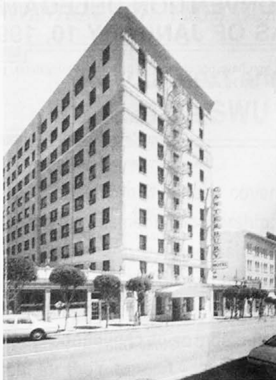
The Canterbury Hotel and Whitehall Inn 750 Sutter near Taylor San Francisco, CA 94109