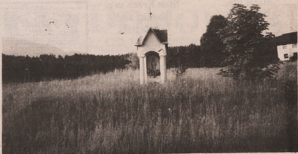
Religious markers that dot the Carinthia area