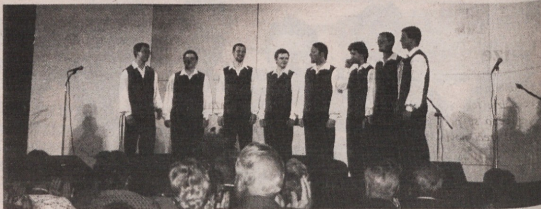
NA ODRU SLOVENSKEGA NARODNEGA DOMA NA ST. CLAIR AVENUE V CLEVELANDU 7. JULIJA: zgoraj Mendoški oktet, spodaj ansambel Los Chañares