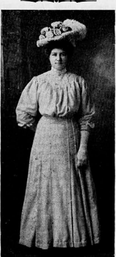
Was the chapeau as heavy as it looked?