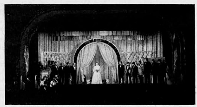
And so... she's presented... a Debutante is spotlighted, center-stage at the 1974 Cotillion in Cleveland.

April 27 — PENNSYLVANIA, N.Y. STATE CONVENTION, Br. 71, Meadowlands, Pa.