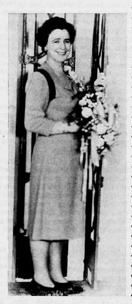
The first modern styles were practical.