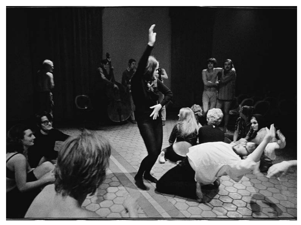
The tribe of Pupilija Ferkeverk in 1969.

Kralj's thoughts about theatre were very close to the thoughts of together with the predominately visual arts community OHO probably the most influential artistic community of the 1960s within the field of the performing arts, Pupilija Ferkeverk. In 1970, while performing in Zagreb, Pupilija published its mini-manifesto in the student newspaper Studentski list. It reads: