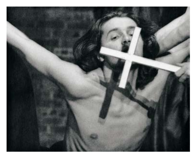
Missa in a minor, Mladinsko Theatre, 1980.