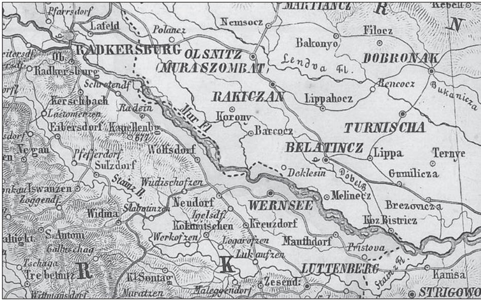
River Mura between Radgona and Ljutomer, 1872.

and adding gravel. 24 These measures can thus be interpreted as the very opposite of the interventions in the 19 th and 20 th century. From the viewpoint of environmental history, the example of Mura is interesting because of the relationship between the river and human interventions in the long run: if repeated attempts had been made to “capture” Mura into a single fortified river bed for more than three centuries (and regulate its unpredictable tributaries), in the last few decades measures have been initiated to undertake a (limited) reconstruction of the pre-regulation conditions. 25