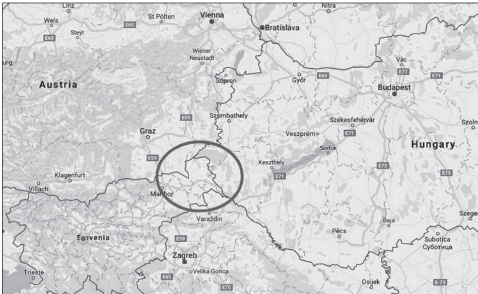
The wider geographical area.