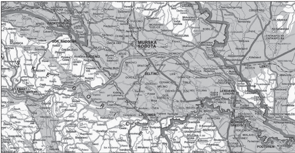
The border river Mura between Slovenia and Austria; the Slovenian “internal” Mura; and the border river Mura between Slovenia and Croatia (contemporary situation).

It flows through Slovenia in the total length of 95 kilometres, and the section of the Slovenian “internal” Mura is approximately 33 kilometres long. 3 Mura represents borders in the total distance of 115 km (25 % of the whole river). First it divides Slovenia and Austria between the villages of Ceršak and Petanjci (in the distance of over 33 km); then Slovenia and Croatia between Gibina and Krka (almost 34 km); and finally, Hungary and Croatia in the distance of 48 km between Krka and until it flows into the river Drava. 4 This contribution will focus on three sections: the border river Mura between Slovenia and Austria; the Slovenian “internal” Mura; and the border river Mura between Slovenia and Croatia.