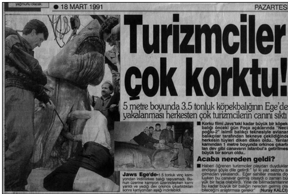
Fig. 2: Page of the newspaper reporting the capture of a great white shark (specimen No. 2) on March 18, 1991, off Foça.

Sl. 2: Časopisna stran s poročilom o belem morskem volku (primerek št. 2), ujetem 18. marca 1991 v bližini Foča.