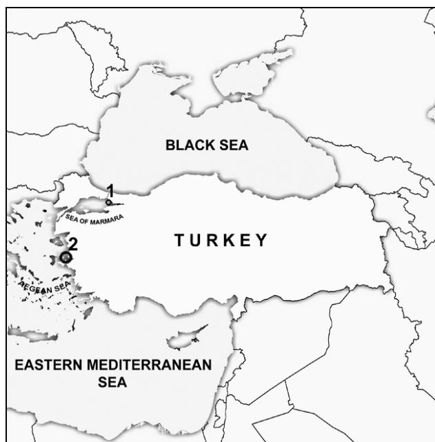
Fig. 3: Fishing localities (circles) of great white sharks in the Sea of Marmara (specimen No. 1) and in the Aegean Sea (specimen No. 2).

Tuna has always been a primary prey for Mediterranean white sharks, and interactions between these apex predators and tuna fishery have been documented in details (Barrull & Mate, 2001; De Maddalena, 2002; Kabasakal, 2003; Morey et al. , 2003; Galaz & De Maddalena, 2004). Great white shark has been a by-catch of Marmaric tuna hand-liners, until the decline of tuna stock in the Sea of Marmara in 1980's (Kabasakal, 2003). The recent presence of C. carcharias in coastal waters of the Turkish Aegean Sea in the 1990's, can also be inferred from accidental captures by commercial fishing gears deployed for tuna (e.g. purse-seines), as