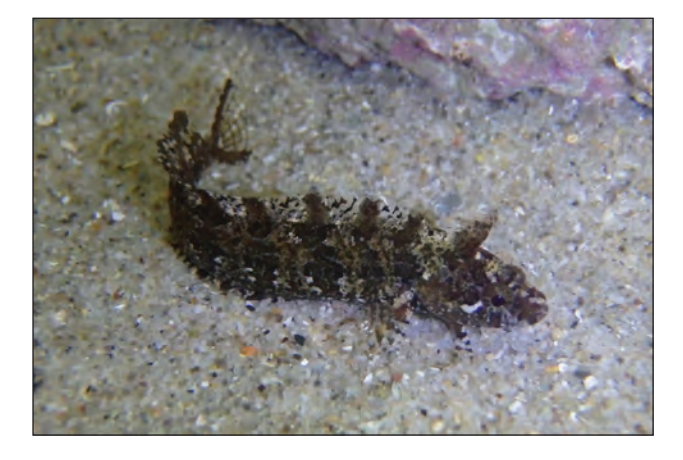
Fig. 1: A specimen of Clinitrachus argentatus found in Slovenian coastal waters. Sl. 1: Primerek vrste Clinitrachus argentatus najden v slovenskih obalnih vodah.

The data regarding the occurrence of C. argentatus in the Adriatic Sea are scarce, limited and sporadic. Patzner (1985) reported the finding of two specimens