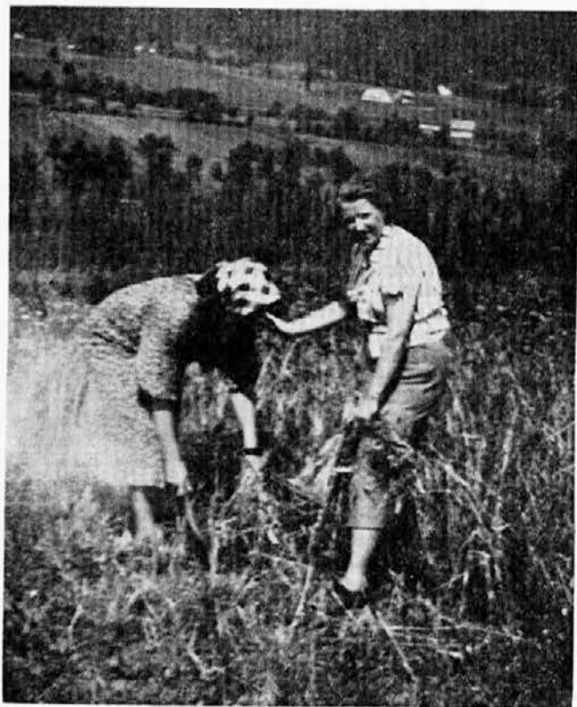
Ameriške žanjice na Rečiškem polju (Slika vzeta na prvem obisku)

Idila tvoja je zamrla, vonjav in barv prelestnih tu več ni. Utihnili žanjic in ptic so grla, vse to, kar oko in srce razveseli.