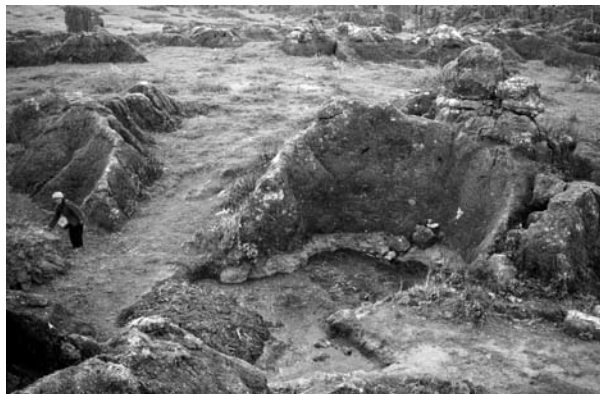
Figure 6: Subcutaneously shaped stone teeth.

Sequence C is 4 m thick. Here the rock is mostly limestone with no more than 10% dolomite crystals. The boundary between sequences B and C is sharp and immediately