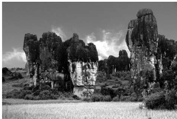
Figure 1: Lao Hei Gin stone forest.

2002). In this article we are adding the results of our exploration of yet another stone forest, unique in its formation.