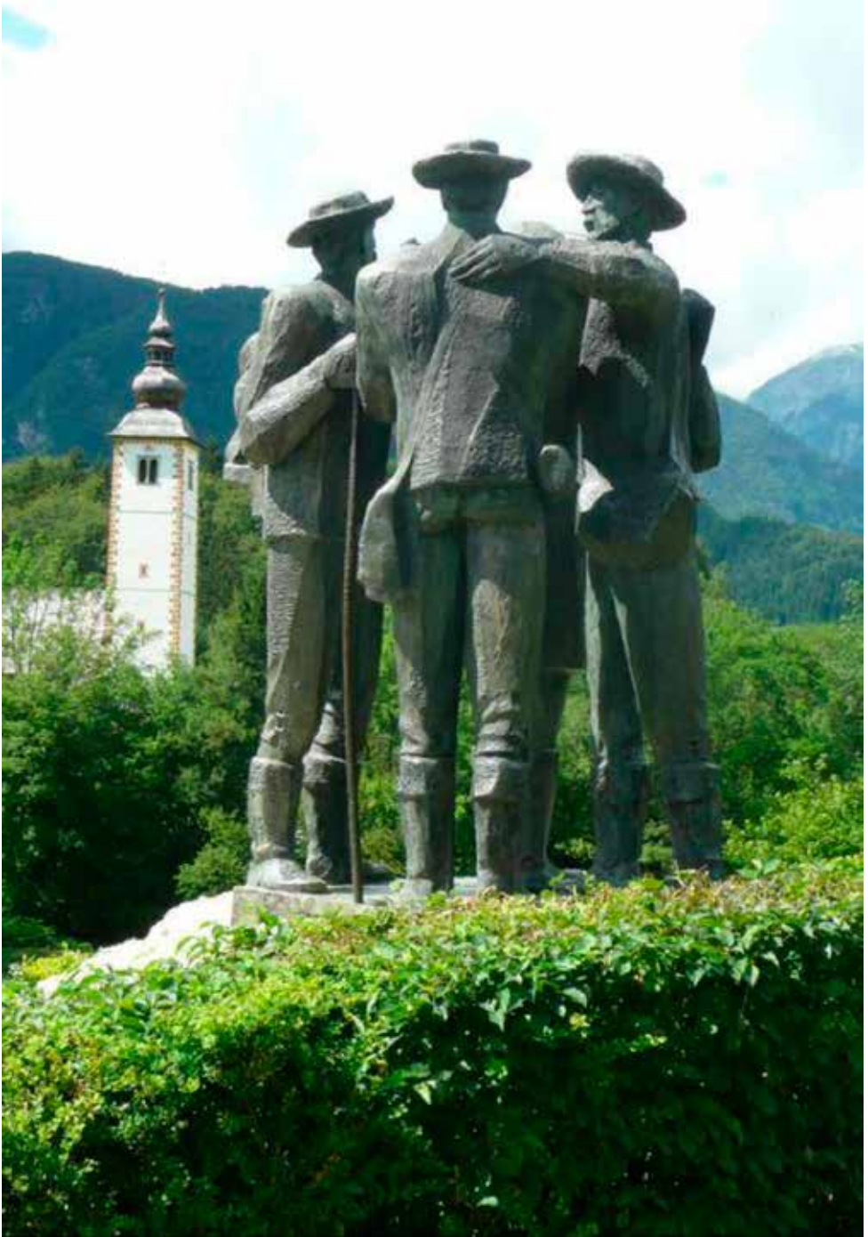
Photo of statue commemorating the four brave men and their climb of Mount Triglav in 1778.