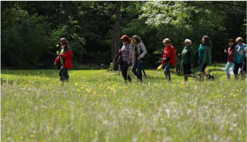
Guided tour and workshop: Flowers in the Kitchen: identifying and gathering flowers (2012). Author: Mitja Sodja, Foto Bohinj.