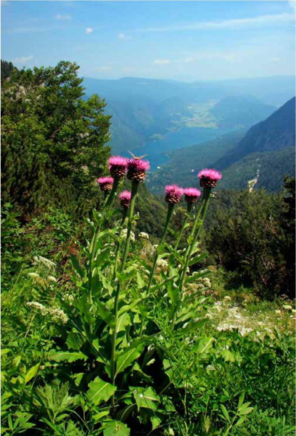
Promotional photograph of alpine wildflower framed against the backdrop of Bohinj Lake (Rapon-tika - Stemmacantha rhapsantica ).