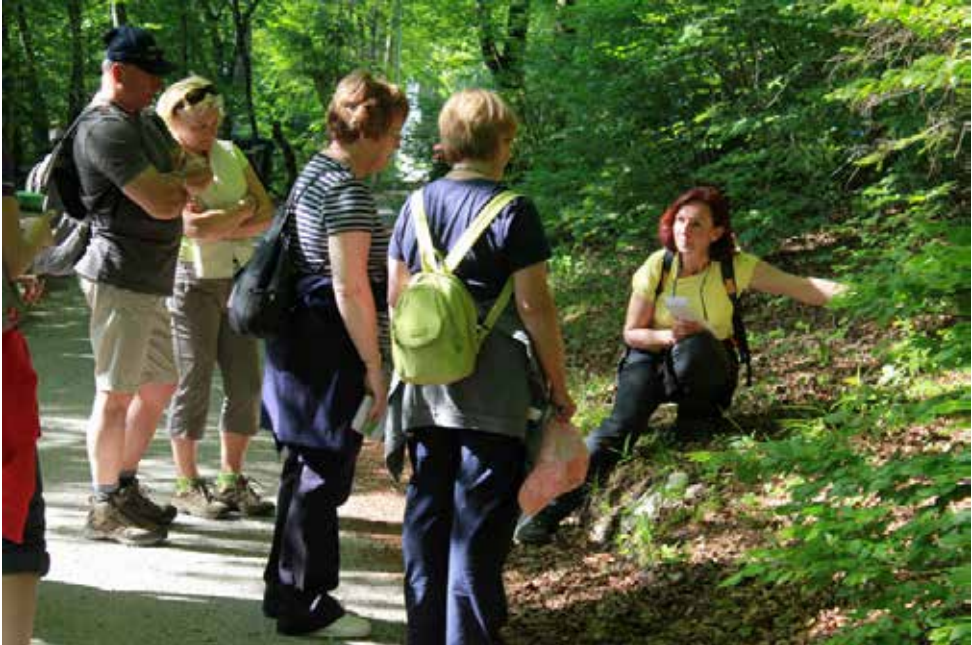
Guided botanical tour of the northern shore of Lake Bohinj (2012).