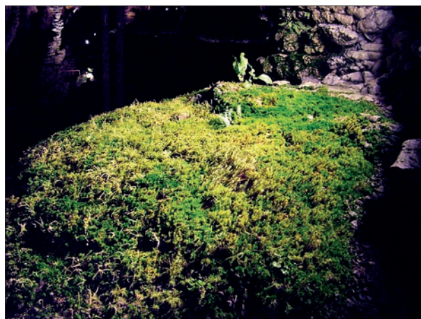
Fig. 2: A well developed lampenflora community dominated by mosses in Grotta Gigante.

As for ferns, Asplenium trichomanes is common throughout the cave; small plants are usually found around lamps, but well-developed individuals occur in highly lit sites wet by continuous dripping water. Asplenium scolopendrium in development in one site is a new record for the inner part of the cave. According to Polli and Sguazzin (1998), the species, which has been de-