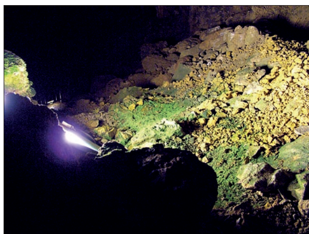
Fig. 5: Clastic deposits and clay promote the growth of large patches of mosses.

and ferns, which usually appear in later stages (Mulec & Kubešová 2010). Near various LED lamps installed along the steps of the downwards pathway, green patches of microalgae were found, but near some LEDs small, very scattered individuals of Bryum sp., Eucladium verticillatum , Fissidens bryoides , Oxyrrhynchium schleicheri , sometimes accompanied by single small shoots of Asplenium trichomanes were observed, extending up to a distance of 15 cm from the lights (Tab. 2, Fig. 3). In the artificial tunnel along the Carlo Finocchiaro path, opened to the public in 1996, lampenflora is colonizing the moist calcareous walls around almost all the fluorescent lamps, with Bryum sp., Didymodon vinealis , Eucladium verticillatum , Fissidens bryoides , Oxyrrhynchium schleicheri ,