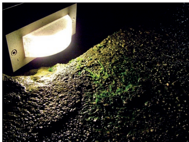
Fig. 3: Small mosses around LED lamps installed along the pathways in 2009.

As for main ecological factors influencing lampenflora in the cave, no particular zonation of bryophyte and fern vegetation was observed along decreasing light gradient around lights, as found by Mulec et al. (2008) for aerophytic algal communities in Slovenian caves. Various mosses and Asplenium trichomanes were observed growing over a relatively wide range of light intensity, in accordance with the findings by Mulec and Kubešová (2010). The poorly lit, most distant areas from lamps are characterized by the constant occurrence of Eucladium verticillatum ; sometimes some reduced plants of A. trichomanes are present there as well.