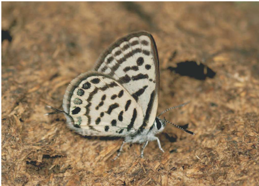
Figure 3. Tarucus balkanicus was found at several new sites in Macedonia. Slika 3. Tarucus balkanicus je bil najden na nekaj novih lokalitetah v Makedoniji.

Macedonia and those from Konecka Mts. are new for this species and well extend its distribution towards NE in Macedonia. The butterflies were observed in dry rocky places; in Radanje mud puddling was seen.