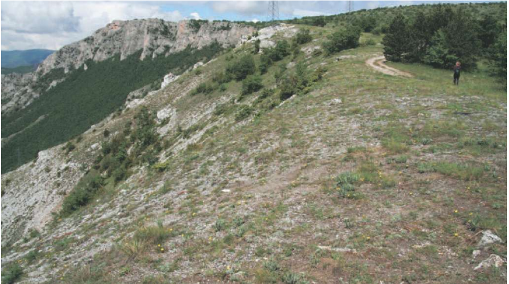
Figure 4. The ridge above Kozjak Lake is one of the butterfly richest places in Macedonia with several rare species like Euchloe penia , Euphydryas aurinia , and Muschampia cribrellum present.

- Cupido osiris - Known only from Ohrid region, Sar Planina Mts. and two squares in SE Macedonia (Schaidler & Jakšić 1989). This is clearly an underrepresentation of the range of this species in Macedonia. Actually this species was among