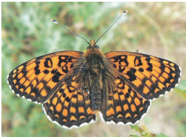
Figure 2. Melitaea telona , a new species of the fauna of the Republic of Macedonia.