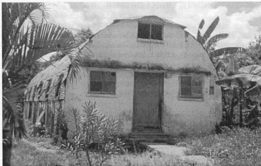
Ena od še ohranjenih pločevinastih barak v emigrantskem taborišču El Trompillo.