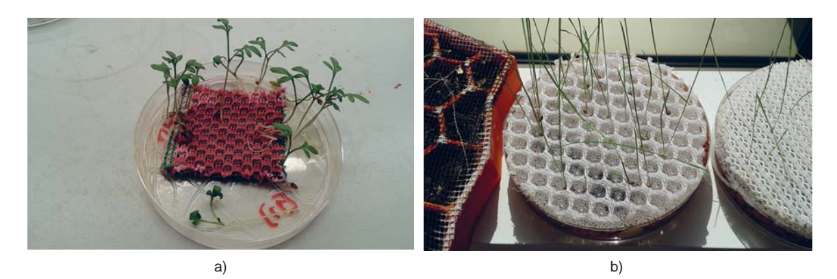
Figure 2: Growth of cress (a) and grass (b) in different textile substrates

heavy wind, etc. These aspects, however, are not relevant for indoor vertical farming, and can be addressed through intelligent textile constructions for outdoor vertical farming ideas.