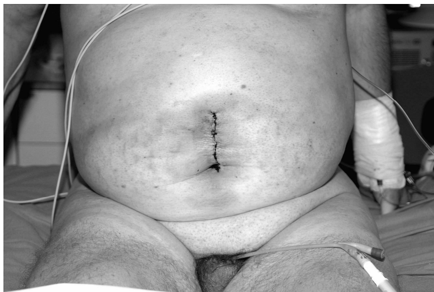
Figure 2 The patient three days after operation