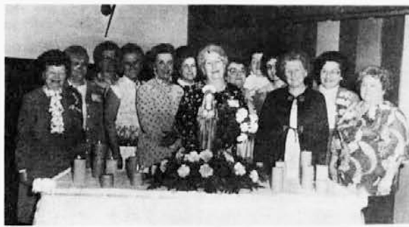
At the Memorial to departed members