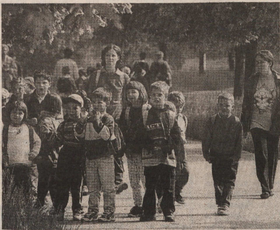
Pomladna prireditev – Pretekli teden od četrta do soboto je bila prireditev Pohod Ljubljana 2001. Pri prireditvi uporabljajo Pot okoli Ljubljane. Kot prvi so krenili na pot otroci iz mestnih vrtcev. Četice malčkov so se z vzgojiteljicami v četrtek dopoldne odpravile iz vrtcev do najbližjih kontrolnih točk. Vrtci so na pohod prijaviili malce manj kot 2600 otrok. Na fotografiji: cilj malčkov iz šišenskih vrtcev je bila kontrolna točka ob Koseškem bajerju. Ob lepem vremenu so otroci videti kar zadovoljni.