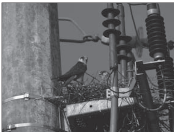
Figure 1: Red-footed Falcon Falco vespertinus nesting in Magpie's Pica pica nest built on a pylon

The species usually nests in old corvids nests (up to 13 - 20 m above ground and within 3 - 4 m from tree tops), especially along hedgerows and occasionally on cliffs or on the ground (CRAMP 1980, SNOW & PERRINS 1999).