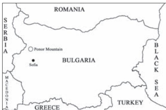
Figure 1: Location of the Ponor Mountains in Bulgaria

Up to year 2000 only fragmentary data about birds of the Ponor Mountain existed. After that more extensive studies were carried out. The bird species composition and status was determined by STOYANOV (2001) and breeding bird distribution and number by NIKOLOV (2003) and NIKOLOV & VASSILEV (2003 & 2004). The aim of the present study was to broaden the knowledge of bird species composition and status.