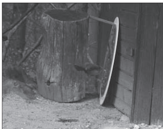
Figure 1: Strong agonistic reaction of 2Y male Blackbird Turdus merula against its self-image, recorded on 17 Apr 2006 at Hrastje near Modraže in NE Slovenia (UTM WM53)

However, on 17 Apr 2006 I observed, at Hrastje near Modraže in NE Slovenia (UTM WM53), a 2Y male Blackbird attacking his self-image in a mirror, although no vocal communication was present (Figure 1). The bird was constantly attacking the mirror through the whole day. When scared, it flew away, but was soon back again repeating its attacking behaviour