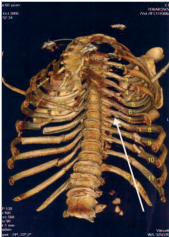
Figure 2. Three-dimensional CT reconstruction of the thoracic cage with broken ribs. Arrow denotes the location of the perforation.

tion has markedly reduced mortality and left surgical fixation usually for selected cases that need a thoracotomy for other reasons (1, 5, 14). Some authors argue that exception to conservative treatment may be found in selective cases if better cosmetic results are preferred (14).