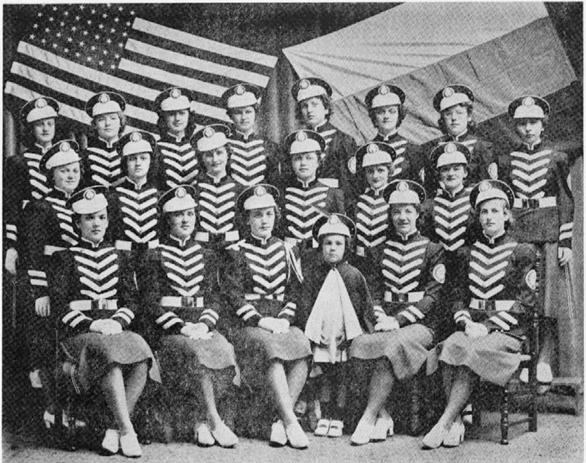
ST. CHRISTINE CADETS, NO. 32 SZZ, EUCLID, O.

We extend to them our heartiest wishes for many more successful and important years ahead, for the good of their members and the organization as a whole. God bless you all.