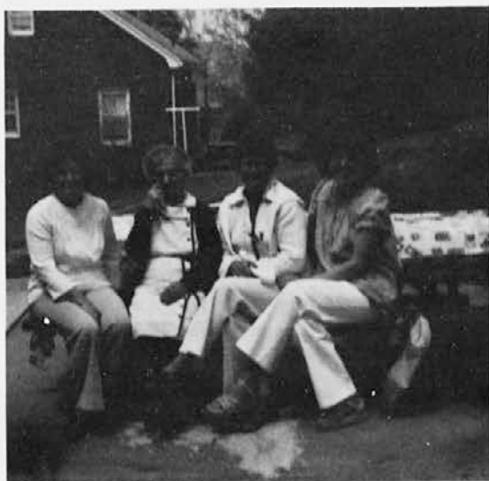
Čestitke našemu jubileju