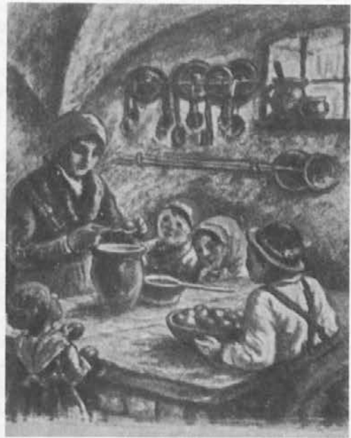
Maksim Gaspari: Barvanje pirhov

Easter eggs are called PIRHE in Slovenia, if they are colored with only one tint; if they are designed with Easter symbols they are called PISANICE. In Slovenia, the family always enjoyed having eggs to color and, on Easter Monday, to play with in games such as hitting two eggs together. Peelings were sometimes spread around the farmhouse to protect the house from snakes; chickens were also given the peels to nibble. But the best was to eat them, ceremoniously!