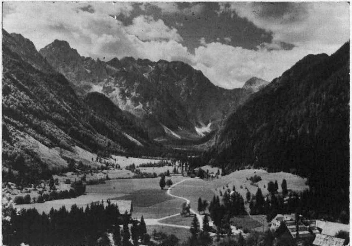
The beautiful Logar Valley, a scenic jewel in Europe

History is full of stories about peoples who disappeared. They were not physically exterminated but were assimilated. They left no descendents in the sense that nobody speaks their language; their customs are gone. Examples are certain Western Slavic tribes that were assimilated by Germans. The same happened to Prussians, a people related to Latvians and Lithuanians. Many Indian tribes in America shared a similar fate. Slovenians have managed to survive under much worse circumstances than they are facing today. Let's hope that they will continue to do so and to prosper.