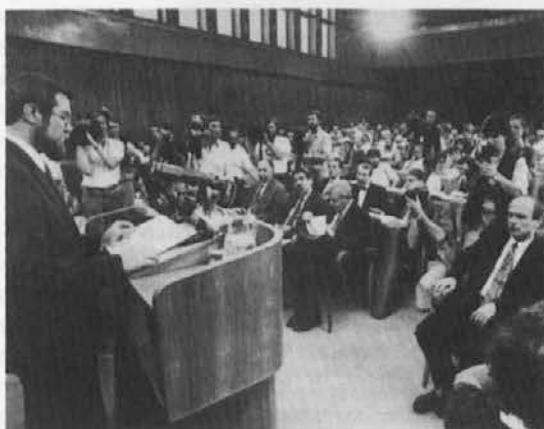
Lojze Peterle (left), first president of the new republic at the Parliament.