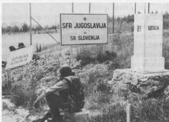
The war included confusion at the border of Italy; is it SFR Yugoslavia or Republika Slovenija?