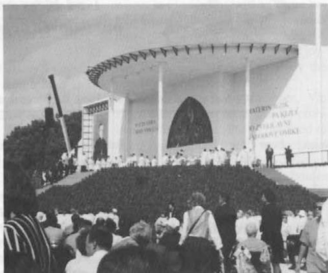
Pope John Paul beatified Anton Martin Slomšek, Sept. 19, 1999, Maribor, Slovenia

All in all, it was a very interesting trip. The Holy