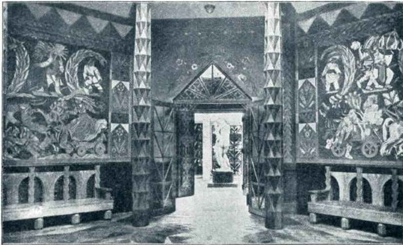
SL. 9. NOTRANJOST POLJSKEGA PAVILJONA.