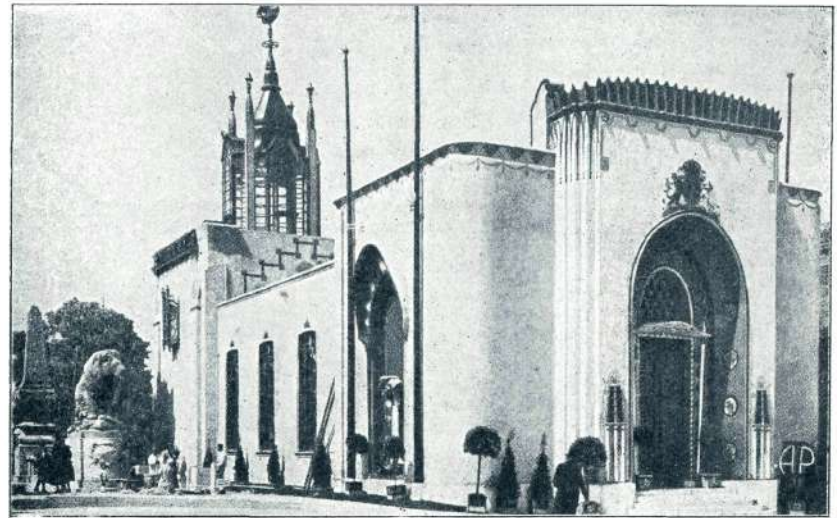
SL. 10. ANGLEŠKI PAVILJON.