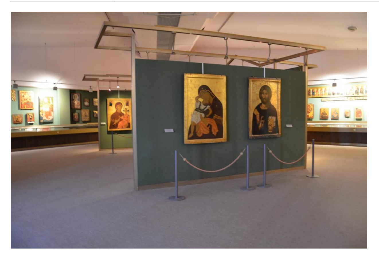
Photo 7: Collection of Orthodox Icons, Museum of Macedonia, Skopje, December 2013