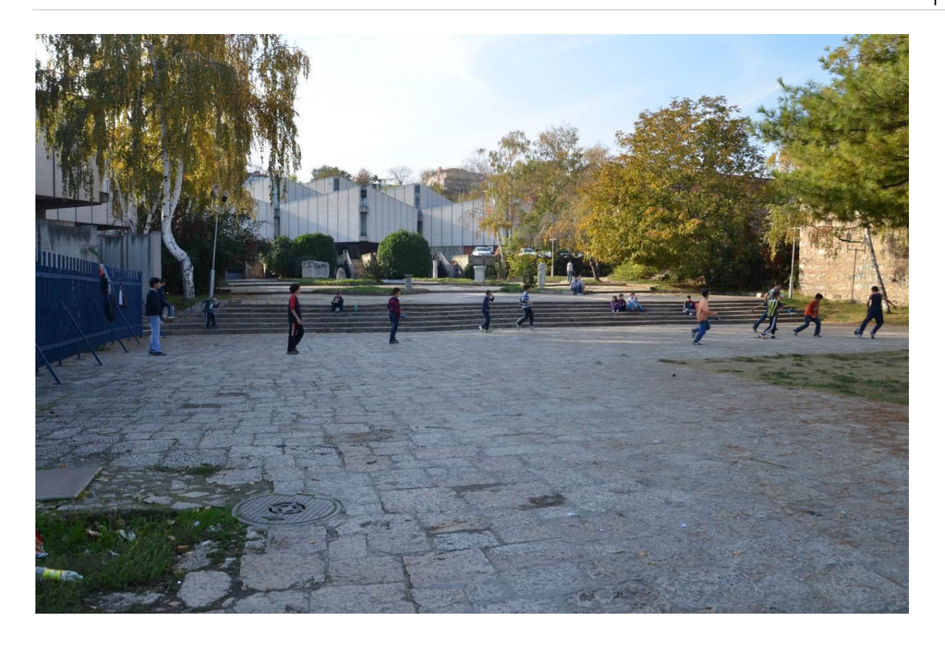
Photo 6: Entrance to the Museum of Macedonia, Skopje, December 2013