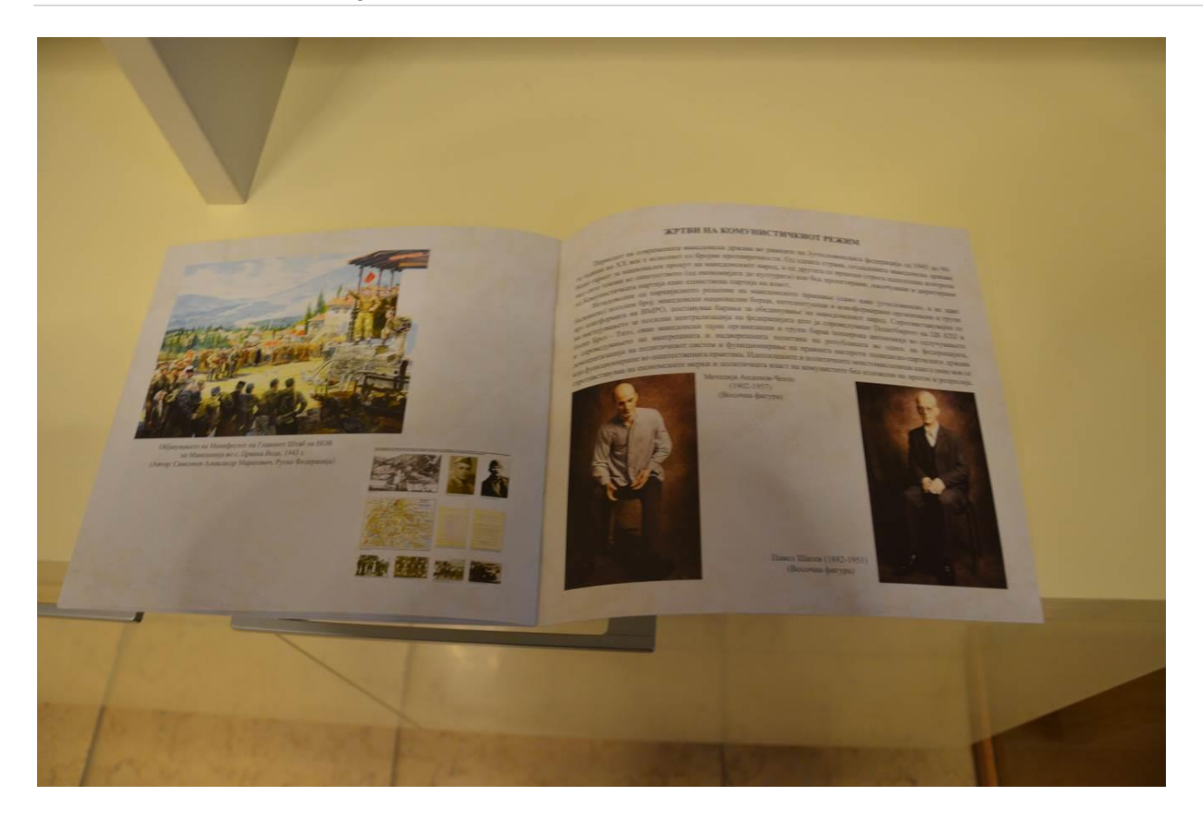
Photo 5: Section from the brochure titled: "Victims of the Communist regime", Skopje, December 2013