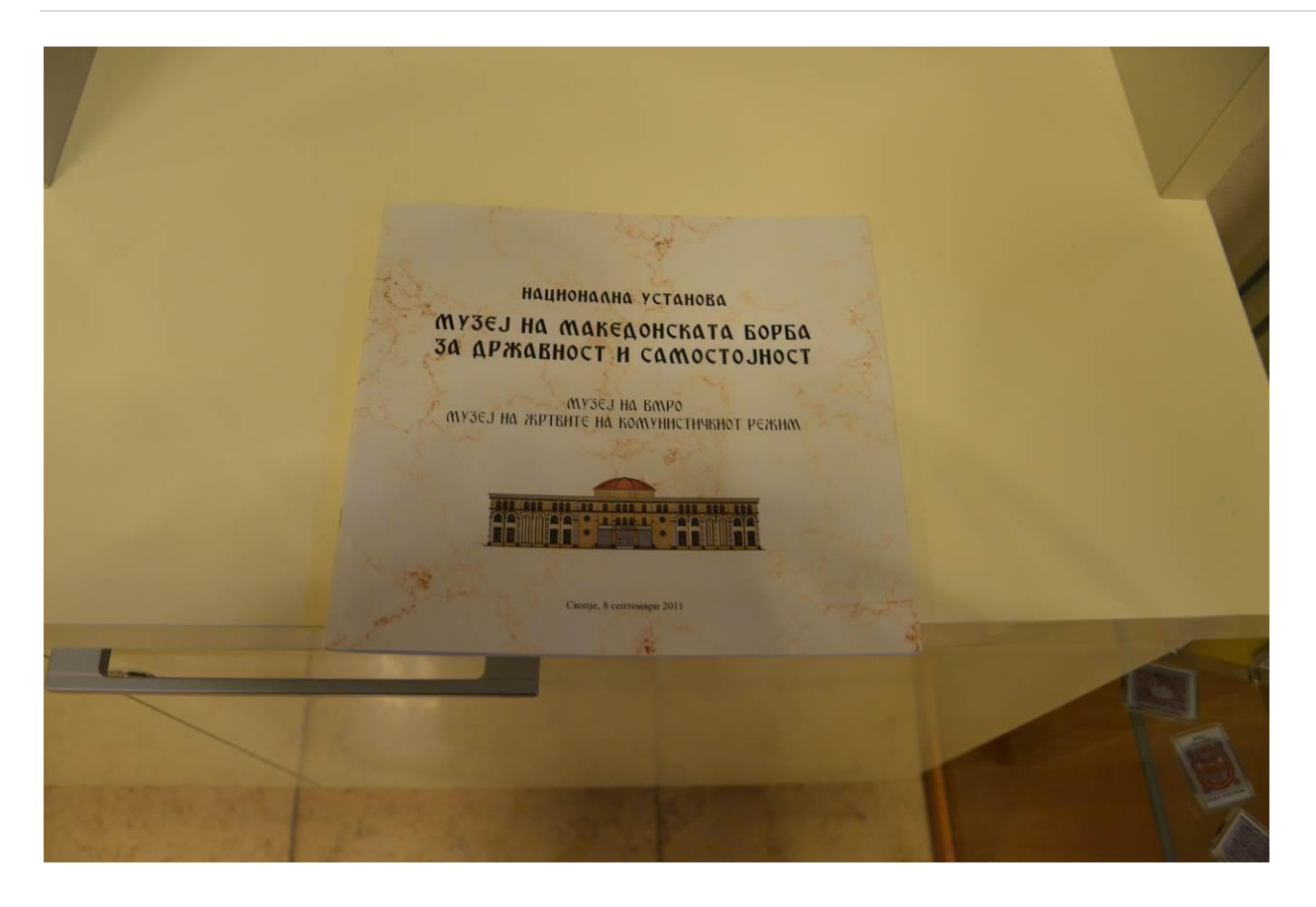
Photo 4: Brochure sold at the shop of the Museum of Macedonian Struggle, Skopje, December 2013