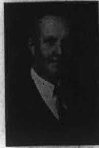
By STEPHEN M. YOUNG, Congressman-at-Large

Washington.—President Truman says people do not like peace-time secrets. British and Canadian officials and also some high Army and Navy officers urged him to withhold information of the Soviet possession of atom bomb secrets and know-how. They might as well have argued with a Missouri mule. The President waited only three days after intelligence groups verified first news of the Russian atomic explosion before announcing to our people the facts of that explosion.