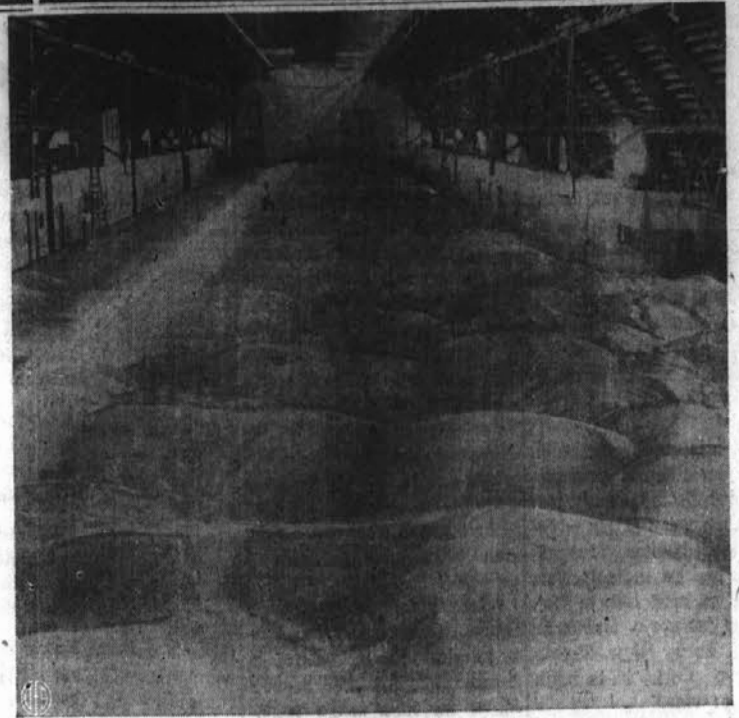
Nekdanje vojaško vežbališče — skladišče za žito. — Lou Gehrig vežbališče v Rochester, N. Y., kjer je nekoč 5.000 mornariških novincev treniralo, je sedaj dobro skladišče za pol milijona bušljev pšenice, katero cenijo na $208.000.

Druga lista je lista "Demokratov", ki pa v resnici nima nič sorodnega z demokratično stranko v mestu Euclid. V kolikor mi je znano, ni na tej namišljeni "demokratiški" glasovnici nobenega kandidata, ki bi kdaj imel kakšen javen važen urad, ki bi ga kvalificiral za administrativni urad. Zdi se mi, da bi bili vsi radi "učenci" na naše rame, ki se jim hoče eksperimentiranja na naše davke. No, strahu ni posebne, ker s svojo listo ne bodo dale prisi, če prav imajo mali blagoslov iz Adler Hotela v Clevelandu. Nas Slovence hore malo zanima ta namišljena "demokratiška" glasovnica. Dati nam nima ničesar, odvzeti pa veliko, če bi zavzela City Hall. (Daje na 8. strani)