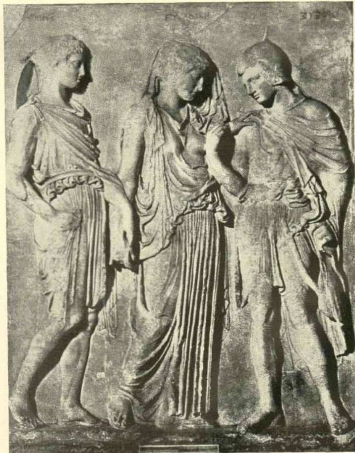
b) ORFEJ IN EURIDIKA. RELIEF