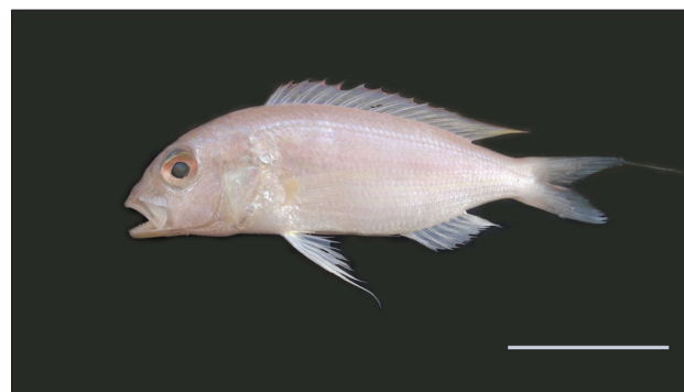
Fig. 2: Nemipterus randalli captured off the Syrian coast: specimen referenced 256 M.S.L., scale bar = 50 mm.

The Syrian specimens were identified following Russell (1990), with main characteristic features as snout length about equal to eye diameter, interorbital width 1.4 to 2.0 in eye, pectoral and pelvic fins very long, reaching to or just beyond level of origin of anal fin, caudal fin forked, upper rays produced into a long trailing filament; body compressed silvery-pink with 3-4 yellow stripes on sides below lateral line, eye salmon pink, dorsal fin pale bluish, caudal fin pink, caudal filament reddish, pelvic fins whitish, pectoral fins transparent. Additionally, morphometric measurements (including percent of standard length - SL) and counts are in total