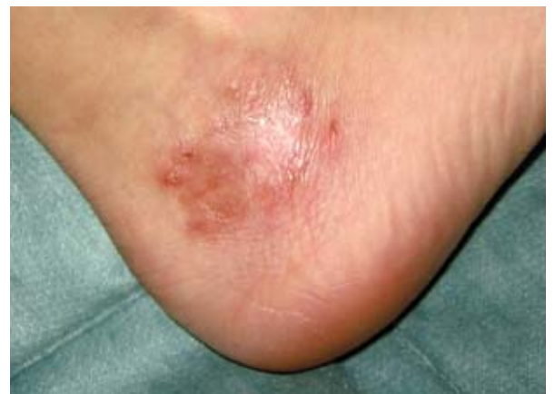
Figure 4. Pyoderma gangrenosum 6 weeks after the start of treatment with infliximab infusions (three doses).