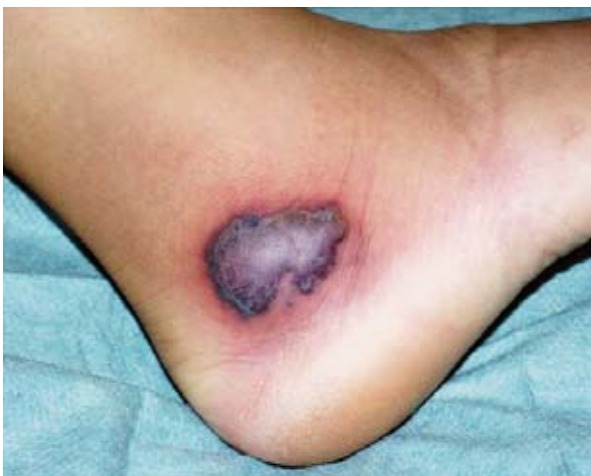
Figure 3. Pyoderma gangrenosum before treatment with infliximab.

pulses of 500 mg each on 3 consecutive days, followed by oral methylprednisolone (60 mg/day) and azathioprine (150 mg/day). Her condition failed to improve. Because of persistent diarrhea she continued to lose weight (15 kg in 3 weeks), and the ulcer on her right ankle grew to the size of 3 × 4 cm and showed no signs of healing (Figure 3). After 3 weeks of the above immunosuppressive treatment, infliximab was instituted. It was administered according to the standard protocol, in a dose of 5 mg/kg given by infusion at weeks 0, 2, and 6. An immediate response was observed. A week after the first infusion, the patient left our hospital with no clinical signs of CD. Over the next 5 weeks, the ulcer on her right ankle healed completely (Figure 4). Since December 2005, infliximab has been administered at 8-week intervals in combination with azathioprine