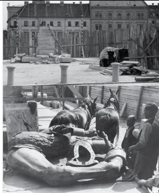
Figure 7: Italians demolish the statue to King Alexander I. in Ljubljana.

»The Karađorđević monuments were erected as expressions of gratitude to the kings who had liberated the Slovene nation. At the same time, they glorified the ruling dynasty and symbolized the idea of Yugoslavism« (Komić Marn, 2013, p.93). A review of the monuments shows that the figurative (thus the most luxurious) monuments dedicated to the kings Peter I. and Alexander I. were not exclusively a matter of larger settlements and that their location was carefully chosen in every case. The statues adorned local centers, central parks, or Sokol Society halls. Several monuments were strategically erected along the state border, where they were supposed to encourage the Slovenes and other Yugoslavs while acting as a reminder to hostile foreigners. The list of sculptors and architects who designed and created the monuments is full of distinguished names of the Slovenian interwar sculpture and architecture milieu, which points to the strict scrutiny enjoyed by said monuments. Even though the monuments were in the service of propaganda meant to