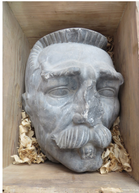
Figure 6: Shortly after the occupation of Ljubljana in 1941, the Italians removed the statues of kings Peter I. and Alexander I. They promised that both statues were to be moved to the National Museum, but both statues were destroyed. In the photo, the head of Peter I., which has been preserved and is now kept in the Museum of Contemporary History of Slovenia.

Alexander's monument erected by the Sokol Society hall was a full-figure figure. This was another statue funded by the Sokol Society, namely by the Trbovlje charter and a couple of other societies. The leadership of the society raised funds among their members and other people from Trbovlje and commissioned the production of a bronze statue more than two meters high.