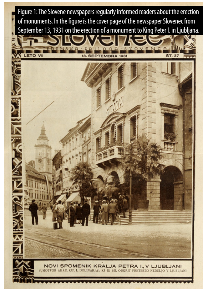
Figure 1: The Slovene newspapers regularly informed readers about the erection of monuments. In the figure is the cover page of the newspaper Slovenec from September 13, 1931 on the erection of a monument to King Peter I. in Ljubljana.

Hundreds of monuments were erected during the interwar period to the members of the Karađorđević dynasty (Figure 1). The state kept an eye on their quality since the committees in charge greenlit the applications to erect monuments that came from local communities after thorough reviews and correctly executed tenders. If the plans did not meet certain artistic standards, the initiative was denied, while already mounted low-quality monuments were removed from the public spaces (Manojlović Pintar, 2014, p.290). There is no complete list of all monuments dedicated to the Karađorđević dynasty on the