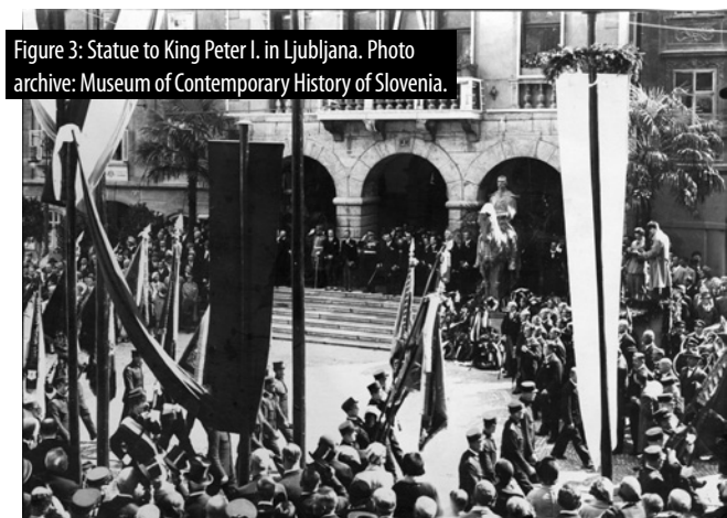
Figure 3: Statue to King Peter I. in Ljubljana.

The monument was unveiled with pomp on September 6, 1931, as part of the so-called King's Week, a series of events celebrating the 10th anniversary of King Alexander's rule. Up to 100,000 people reportedly participated in festivities. Engineer Ladislav Bevc was the main orator and he emphasized: „The monument created by our master sculptor Lojze Dolinar is an expression of happiness, pride, and gratitude of the Slovenian folk for the historical fact of liberation and unification. The artist breathed life into stone with love and sacrifice of Slovenian people; the life that will watch over the destiny of our history, which was forever tied to the destiny of the royal house of Karađorđević.“ These words were accompanied by the thunder of cannons on Ljubljana Castle and