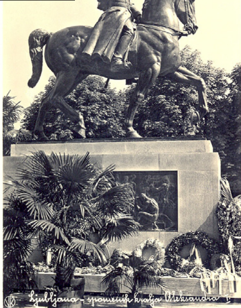
Figure 5: Statue to King Alexander I. on the Congress Square in Ljubljana. It was erected on September 6, 1940.

Square in Ljubljana (Figure 5). The idea was raised a week after the king's death when the organization of military volunteers started fundraising. The fiery appeal written by poets Oton Župančič and Alojz Gradnik said: „His outer image, carved in a hard mass of marble and bronze shall be the symbol of victory over the destructive power of Death. [...] Both in the center and on the frontiers, may His monument be the source of faith, steadfastness, and fortitude; the center for all our holidays of joy and sorrow; for all our victories. May it be the haven for all our affliction and anguish, for all our humiliation and defeats. When our spirit yields and diminishes, when our pride and dignity stumble and shiver, may His image comfort and encourage us, lift and enthrall us. Marrying present with future, may our heirs express the gratitude of our memory of His acts and His sacrifice. May he be the fountain that gives us strength, the light that shines, the hearth that warms. And may all the sinister and wicked heed this warning: The King is dead - Yugoslavia remains! “ (Rojaki, 1934). Fundraising for this monument gathered more attention than the one for King Peter I. in Ljubljana. If the latter couldn't muster half a million dinars, the monument to Alexander raised 1,600,000 dinars in three years. It was evident that King Alexander became the fundamental figure of the Kingdom of Yugoslavia (Manojlović, 1997).