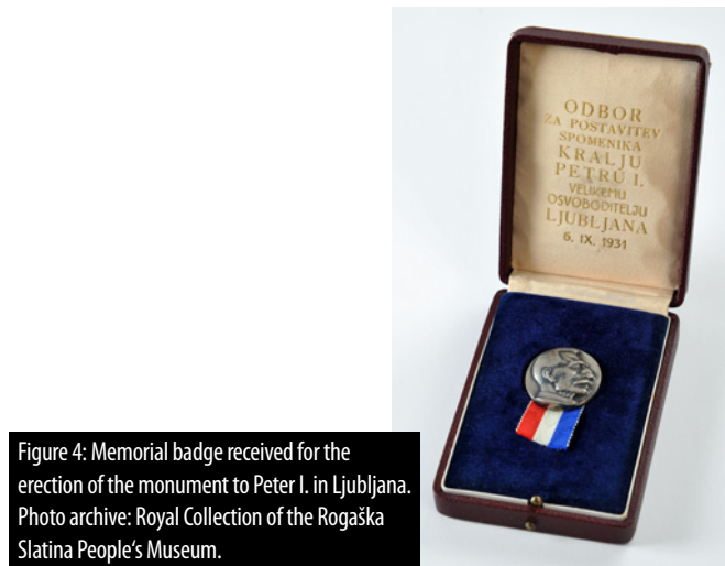
Figure 4: Memorial badge received for the erection of the monument to Peter I. in Ljubljana.

the loud cheering of the crowds as the monument was unveiled (Govor, 1931). What Ljubljana obtained with Dolinar's statue, is its first equestrian monument, many European cities already boasted (Jezernik, 2014).