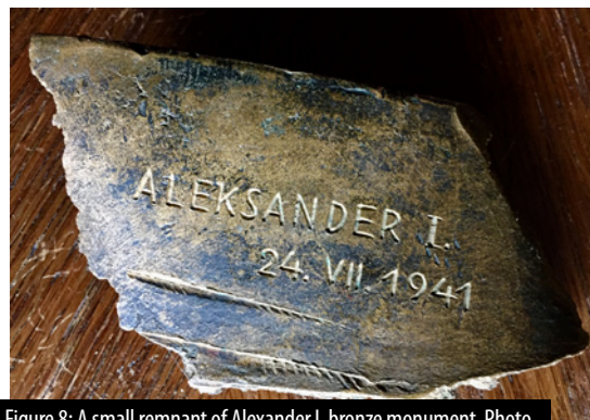
Figure 8: A small remnant of Alexander I. bronze monument.

strengthen the power of the state, they were also works of art, thanks to carefully selected authors. Unfortunately, none of the monuments described is preserved. During the World War II occupation, statues depicting the former royal dynasty were an unwanted memory of a bygone era in the eyes of the occupiers and were therefore destroyed in the first weeks and months of the occupation (Figures 6–8; Mikša, 2018).