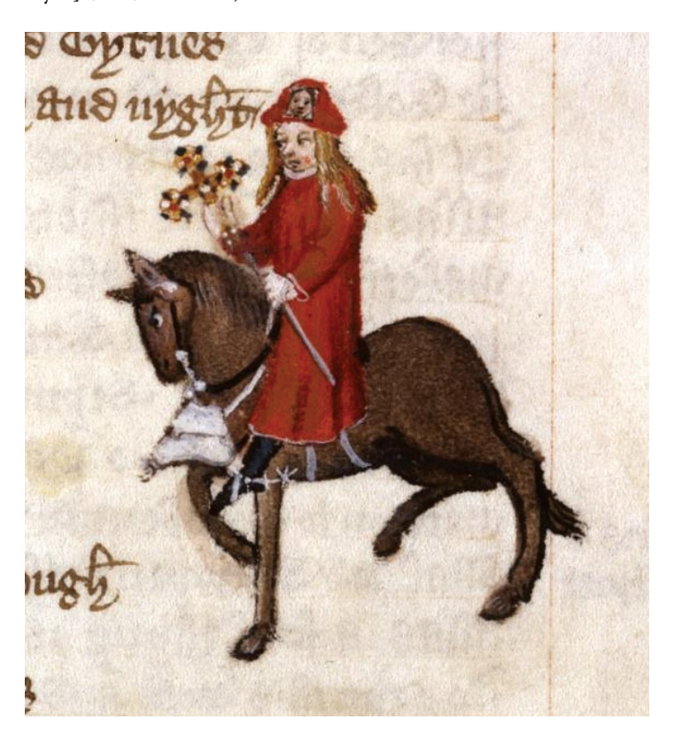
Figure 2. The Pardoner in the Ellesmere manuscript of The Canterbury Tales (c. 1400–1410), Wikimedia Commons: https://commons.wikimedia.org/wiki/File:The_Pardoner_-_Ellesmere_Chaucer.jpg.

shuldres overspradde; / [...] thynne it lay, by colpons oon and oon / [...] / dischevelee [as yellow as wax ... smooth it hung ... down thinly ... covered his shoulders ... sparsely it lay, by shreds here and there ... dishevelled]"; GP, 675–683), his glaring eyes ("swiche glarynge eyen hadde he as an hare [he had staring eyes like a hare's]"; GP, 684), high voice ("a voys he hadde as smal as hath a goot [a voice he had as high as a goat's]", 688), conspicuous lack of facial hair ("no berd hadde he, ne nevere sholde have [no beard had he, nor ever would have]"; GP, 689–690) and his self-consciously trendy style ("but hood, for jolitee, wered he noon, / [...] / hym thoughte he rood al of the newe jet [yet, for amusement, he wore no hood ... he thought he rode in the latest style]"; GP, 680–682).