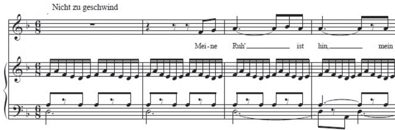
Figure 1: Spinning-wheel-motif (mm. 1ff.)

we might think of Schubert's Gretchen am Spinnrade (1814), setting a poem from Goethe's Faust to music and presenting exactly our test conditions: Gretchen is sorrowfully longing for her distant beloved. As the text begins with her grief, becoming more passionate and finally clearly erotic, the song follows this structure of climax by increasing melodically and dynamically. It begins musically and emotionally with the 'spinning-wheel-motif' in D minor communicating restless, deep appetent longing (Figure 1).