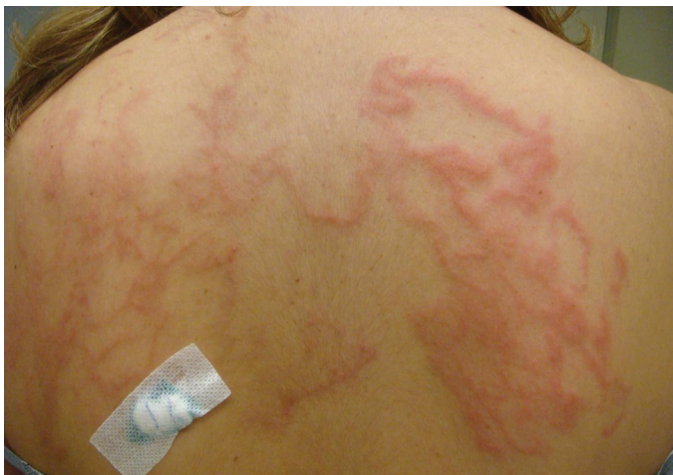
Figure 1 | Erythematous, violaceous plaques on the shoulders.

A 38-year-old woman was referred to our department due to erythematous, violaceous plaques with a serpiginous appearance located on the left shoulder, left thigh, and right buttock, evolving for 5 days. Three days after first being noticed the lesions were widespread, sparing the face, palms, and soles, and an unusual pattern was evident (Fig. 1, Fig. 2).