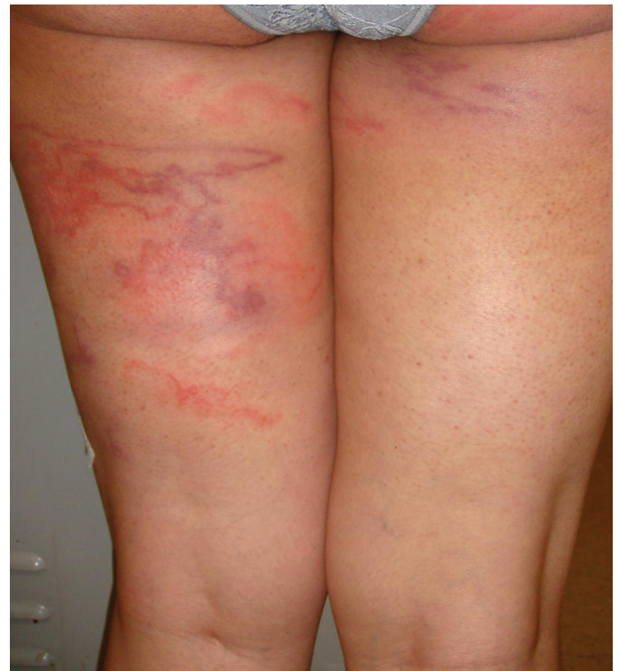
Figure 2 | Serpiginous lesions on the thighs.

and CH50-238 UA), and other immunological tests (anti-nuclear, anti-DsDNA, anti-ENA, circulating immune complexes, and rheumatoid factor negative) were unremarkable and antithyroid antibodies were increased (antithyroglobulin-11.6UI/mL, antiperoxidase 50.2UI/mL). The patient was treated with prednisolone (1 mg/kg per day, slowly tapered) with resolution of skin lesions.