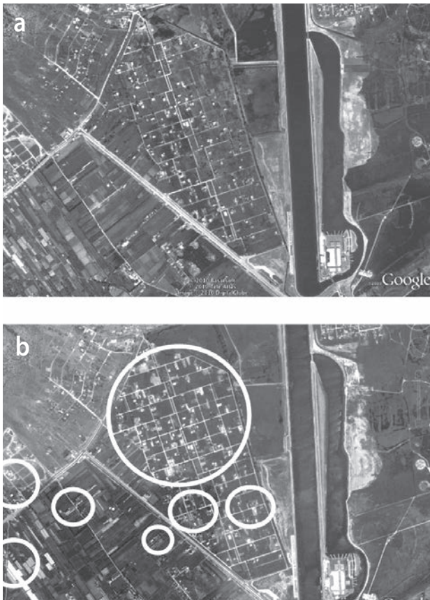
Figure 3: Urban development next to the Olympic Schinias rowing centre: a) in April 2004 and b) in June 2010; leapfrog development is characterised by isolated settlements and small urban nuclei expanding in rural environments. Ribbon sprawl is a typical expansion mode along roads and other infrastructure networks.

driven by sports installations, gave Attica a multi-nucleated spatial configuration, with the formation of clusters around districts that followed a laissez-faire spatial development program in contrast to the expectation of Athens's strategic master plan (Figure 3). The formation of a multi-nucleated territorial asset is particularly evident in the case of the Mesogeia Plain, a vast area that extends east of the Athens conurbation. Mount Hymettus to the west of the area acts as a physical barrier separating the plain from the main conurbation. The beginning of the transformation of the Mesogeia Plain started in the 1980s, when the decision was made to relocate the city's international airport to the area. Subsequent appropriation of agricultural land for airport construction was followed by further infrastructure investment, which was made possible by funds for the Olympic Games. The construction of new roads and rail links connecting the airport with the city significantly improved the area's accessibility. The picture was completed with the construction of two major Olympic venues (the Equestrian Centre and the Shooting Centre, both near the town of Markopoulo), again built on appropriated agricultural land.