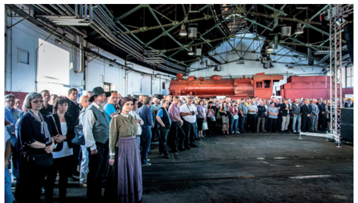
The Railway museum hosted many artists and a few hundred guests