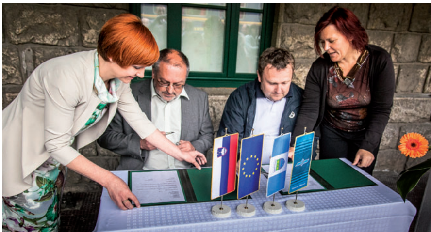
The signing of the agreement of cooperation at the Kanal railway station

the museum staff gave guided tours of the museum in the railway station building. The museum is dedicated to the history of the city of Kanal, the 1 st World War and the development of railways in the region. An info point was set up at the railway station Kanal, offering foreign and Slovene tourists the information needed for exploring Kanal and the surrounding countryside.