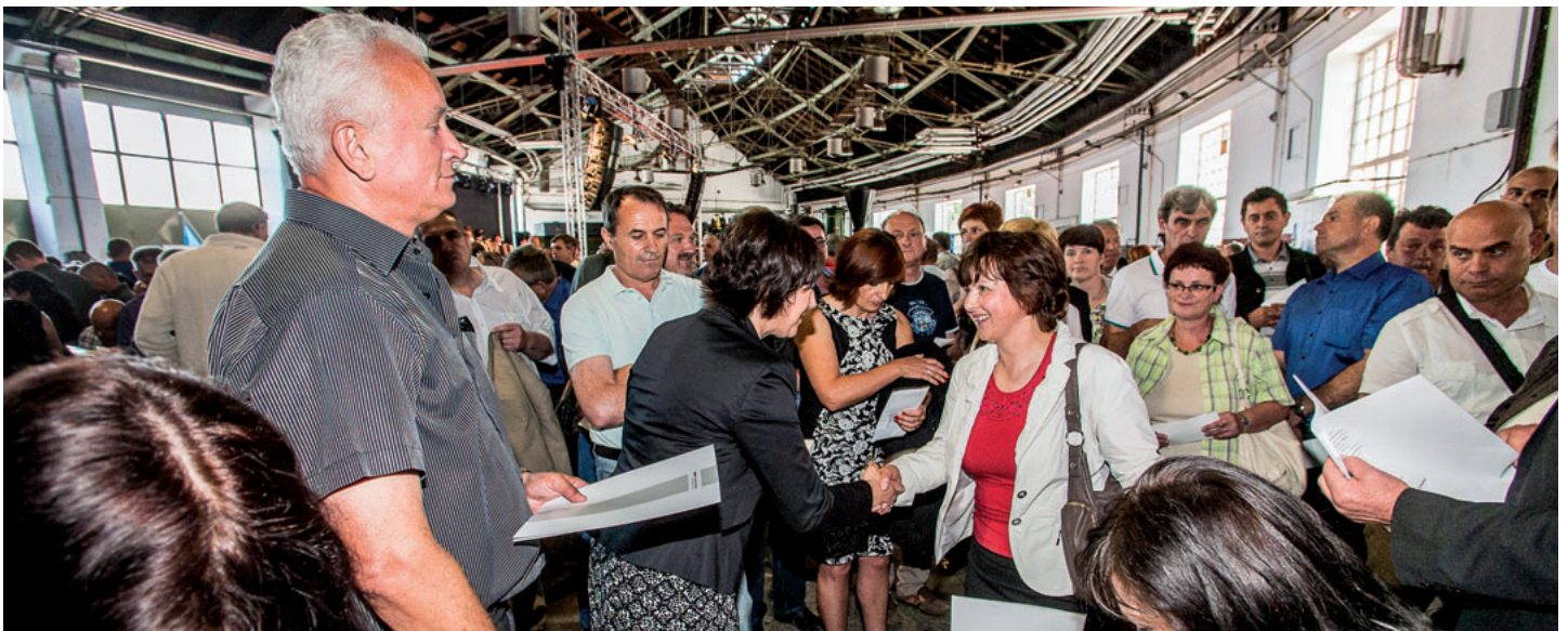
Congratulating co-workers for their 30 th anniversary of employment at Slovenian Railways

This year the guests were welcomed by the sounds of the Slovenian Railways Wind Orchestra Zidani Most whose members,