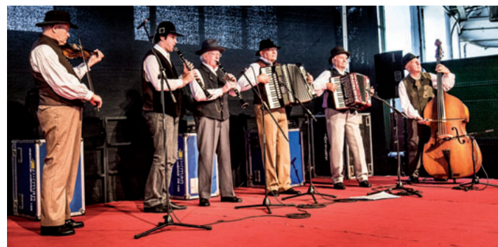
Folklore group ŽKUD Tine Rožanc