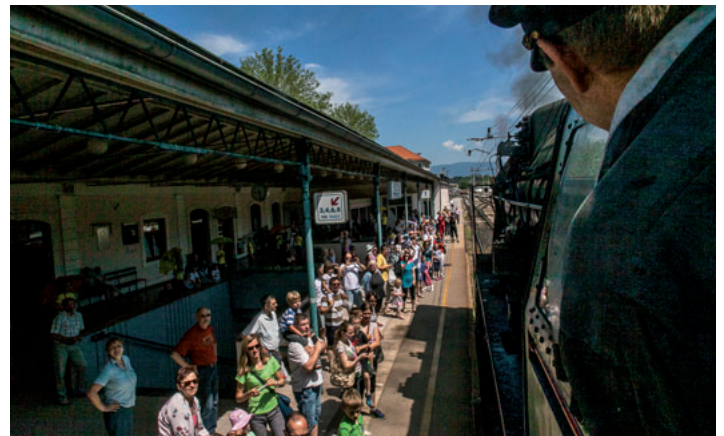
The train arriving in Celje