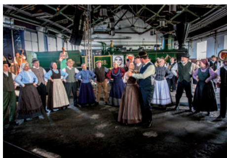
Folklore group ŽKUD Tine Rožanc