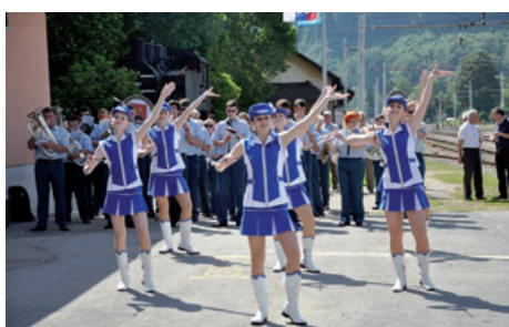
Majorette TRG Sevnica