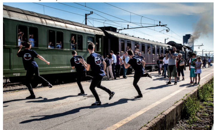
The Artifex on the railway station platform in Ljubljana