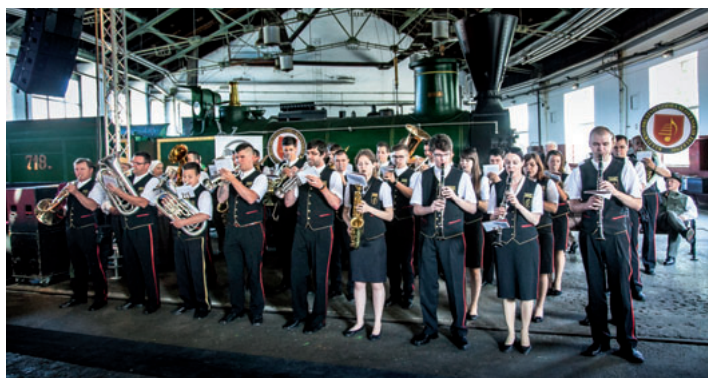
Slovenian Railways Wind Orchestra Zidani Most

Railways sincerely thanks all participating artists. Here are a few glimpses from some of the performances.