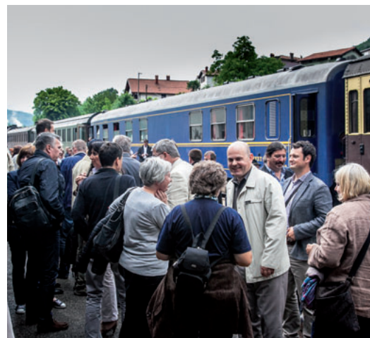
The arrival of the train in Kanal ob Soči