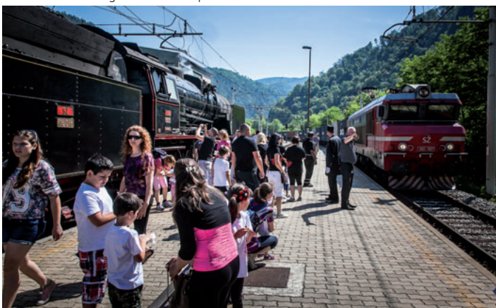
A modern and vintage train meet in Celje