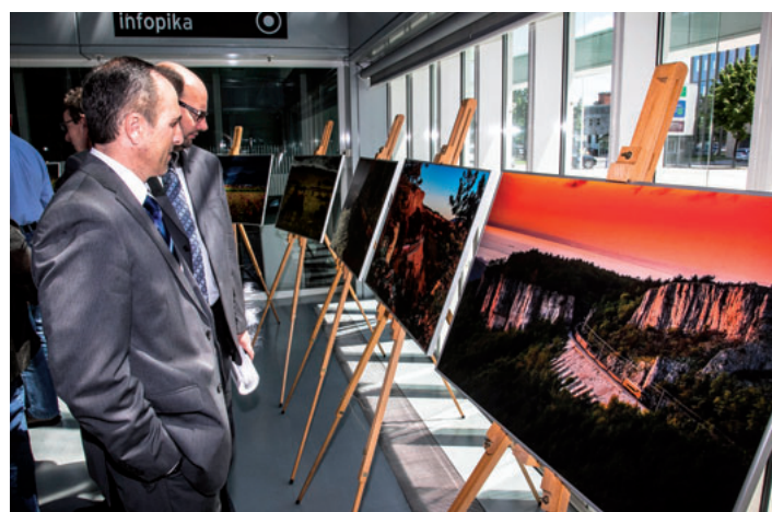
The photography exhibition at the Chamber of Commerce and Industry of Slovenia in Ljubljana