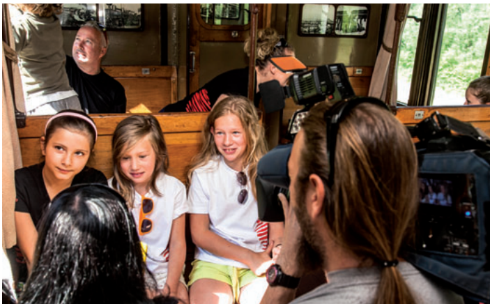
On board the vintage train with Pop TV and Bibaleze.si

We were all very excited that so many children and parents joined us on the museum train ride and even more contented that our guests had truly enjoyed the trip.