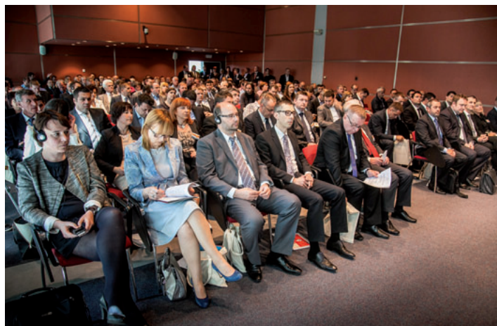
The GZS conference hall was filled to the last seat

Although he believes that Slovenia has a recurring issue of underinvestment in rail infrastructure, which makes predictions of future