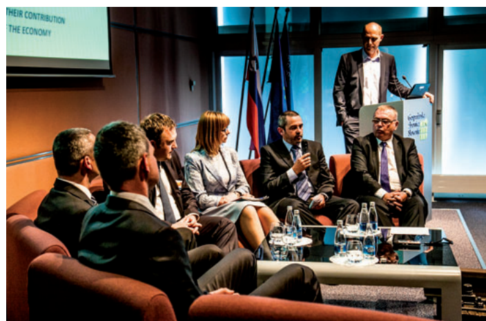
A key emphasis in the discussion was that a clear State decision upon the future of rail and logistics in Slovenia should be formulated as soon as possible.

design additional train and station services. He continued that providing a quality transport experience and operating in integration with other carriers in Slovenia were some of the chief concerns in domestic transport, while cross-border services' vision was to turn Ljubljana into a major regional passenger hub. In conclusion, he outlined the government project on integrated public transport services, which is expected to enter its test stage in March of next year, with remaining services expected to go live by October 2015.