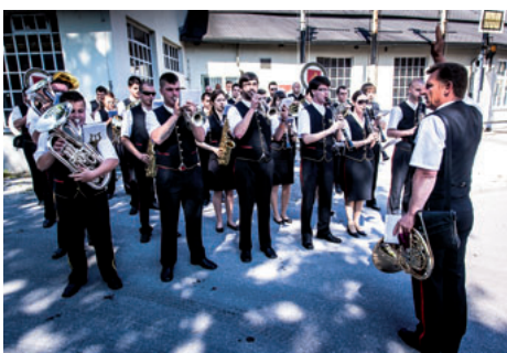
The Slovenian Railways Wind Orchestra