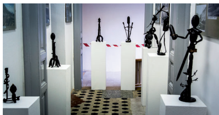
A fascinating combination of art and historical military objects in the museum