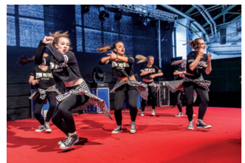
The amazing dancers from The Artifex