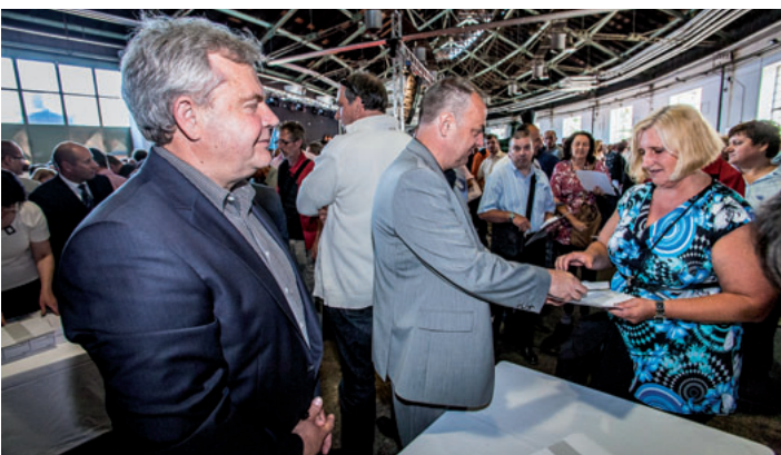
Awards and symbolic gifts were handed out by the management members of each company in the Slovenian Railways Group