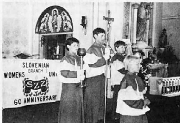
Altar boys at St. Joe's Church in the Convention City are members of the Junior Department.

future. The last one was held Sept. 28, 1986 with a celebration of our 60th anniversary, beginning with Holy Mass at 10:30 a.m. at St. Mary's Church. About 80 members attended. We then enjoyed a very good luncheon at the church hall. Our State Convention was successful. See you in Joliet. With best wishes for a successful convention.