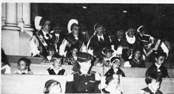
Sweet faces of Joliet Junior members brought a smile to everyone present at the beautiful Mass. Their colorful uniforms complimented the festive Slovenian National Costumes worn by adult members from Chicago, Sheboygan, Willard and Oglesby.

Our winter has been very mild and it seemed like Christmas came and went so fast, but I did manage to attend a few of the branch Christmas parties that I was invited to.