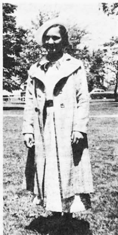
"We looked like this in 1933", says "I".